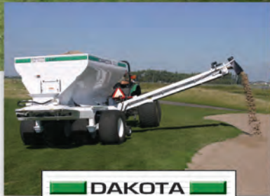
DAKOTA Peat & Equipment