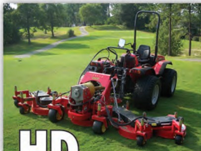
HD High-Definition Mowing LASTEC