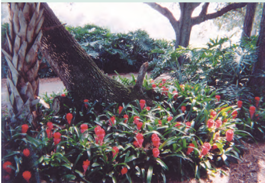
Second Place – Bright red bromeliad bed under the oaks at No. 18 tee.