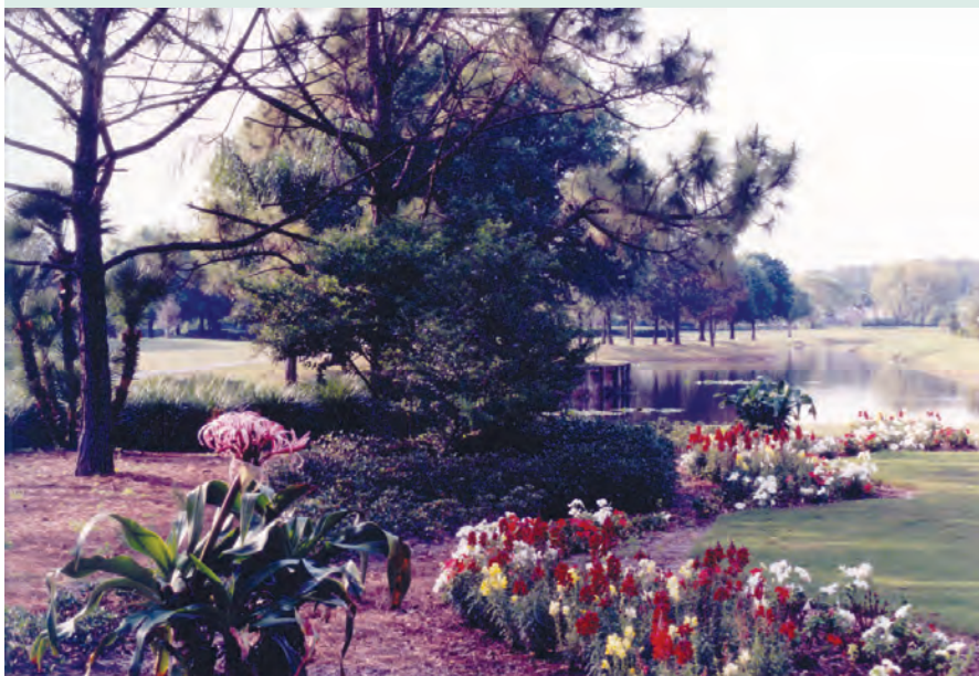
First Place – Snapdragons give some snap to this native area on the second hole at the Lansbrook G.C.