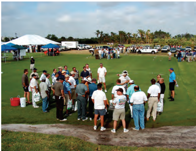
Morning turf plot tours were just one of the highlights of the 19th SFGCSA Turf Expo at the UF/IFAS Research Education Center in Ft. Lauderdale.