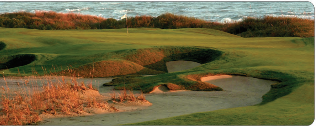
Kiawah Island Golf Resort

To contact a grower, visit seaislesupreme.com