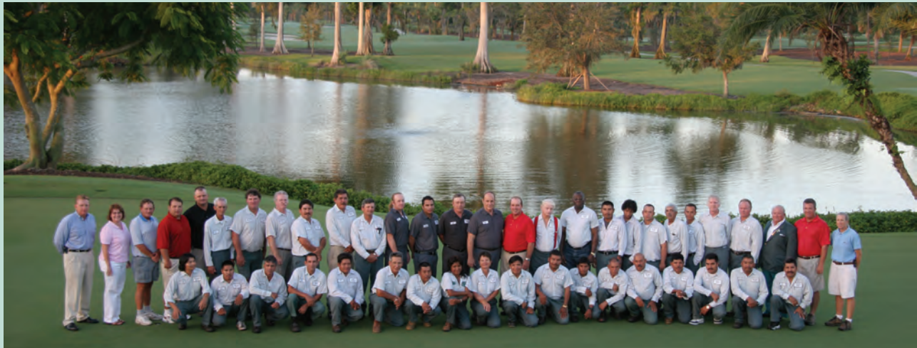
Royal Poinciana Golf Maintenance Staff