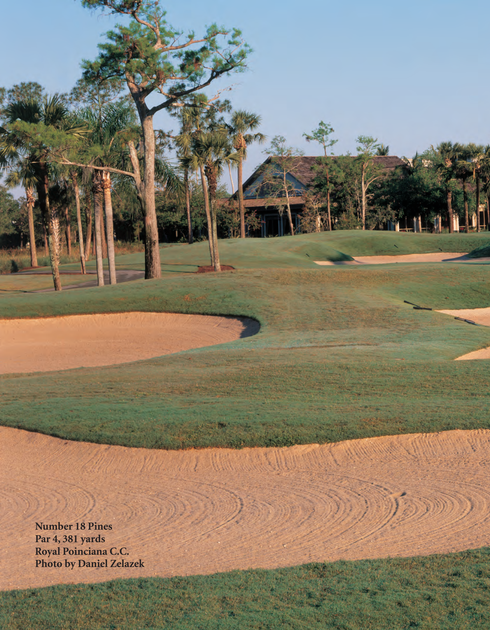
Number 18 Pines Par 4, 381 yards Royal Poinciana C.C.