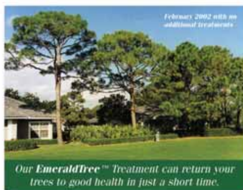
Our EmeraldTree™ Treatment can return your trees to good health in just a short time.