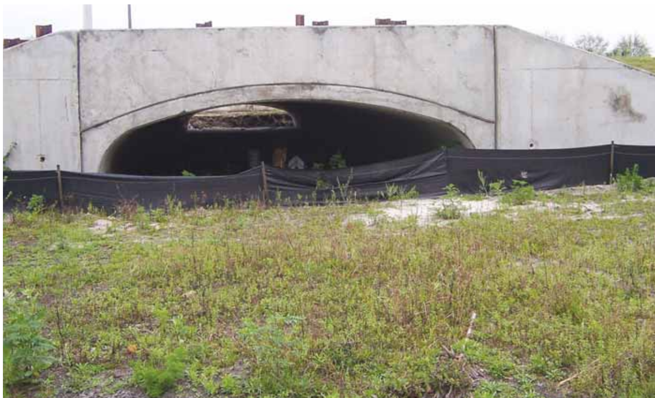
A serious amount of wildlife can get through this corridor! I know it looks small in this picture, but my guess would be that it is about 20 ft. wide.

Foxfire leadership takes its ACSP very seriously and everyone works hard at maintaining the environmental integrity of the property. The club has some exciting projects under way, and in particular I am sure the members are looking forward to the new clubhouse that was under construction at the time of our visit. The highlight for me, however, was the bald eagle that swooped down over the lake, picked up a fish, flew right over our heads and landed in a nearby tree to have lunch! I'm still not quite sure how they arranged for the eagle to perform on