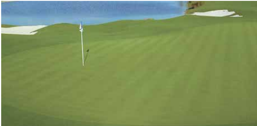
SeaDwarf, which was used on the Crown Colony Golf Club shown here, is another of the popular paspalum cultivars being used on golf courses.

as possible, depending on the various sources that can be blended. Install chemigation equipment on the irrigation system to have the flexibility to apply liquid fertilizers, amendments such as flowable lime or gypsum, wetting agents, or other chemicals.