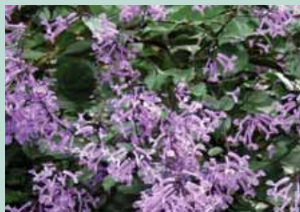
'Mona Lavender' Plectranthus

Common name: Nun's Orchid Botanical name: Phaius tankervilleiae Hardiness: Zones 8-11 Mature height and spread: 3 ft. x 1.5 ft. Classification: Orchid-ground cover Landscape use: Perennial for mass use or as specimen in part shade. It is also good used as a potted plant Characteristics: Sword-shaped leaves develop as the tall inflorescence of white, rose and brown flowers reaches full bloom in the late spring. The Nun's Orchid goes dormant in North Florida.