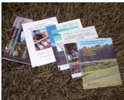
Some of the Best Management Practice manuals written when BMPs were voluntary.

In the photo below is just a handful of BMP type manuals dealing with springs protection, agricultural chemical handling and storage, silviculture (forestry), green industries (primarily lawn care) and the old IFAS manual for BMPs which was focused on growing turfgrass primarily and not necessarily on environmental impacts. There are other BMP manuals out there for