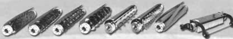
Thatch-Away® SUPA SYSTEM®