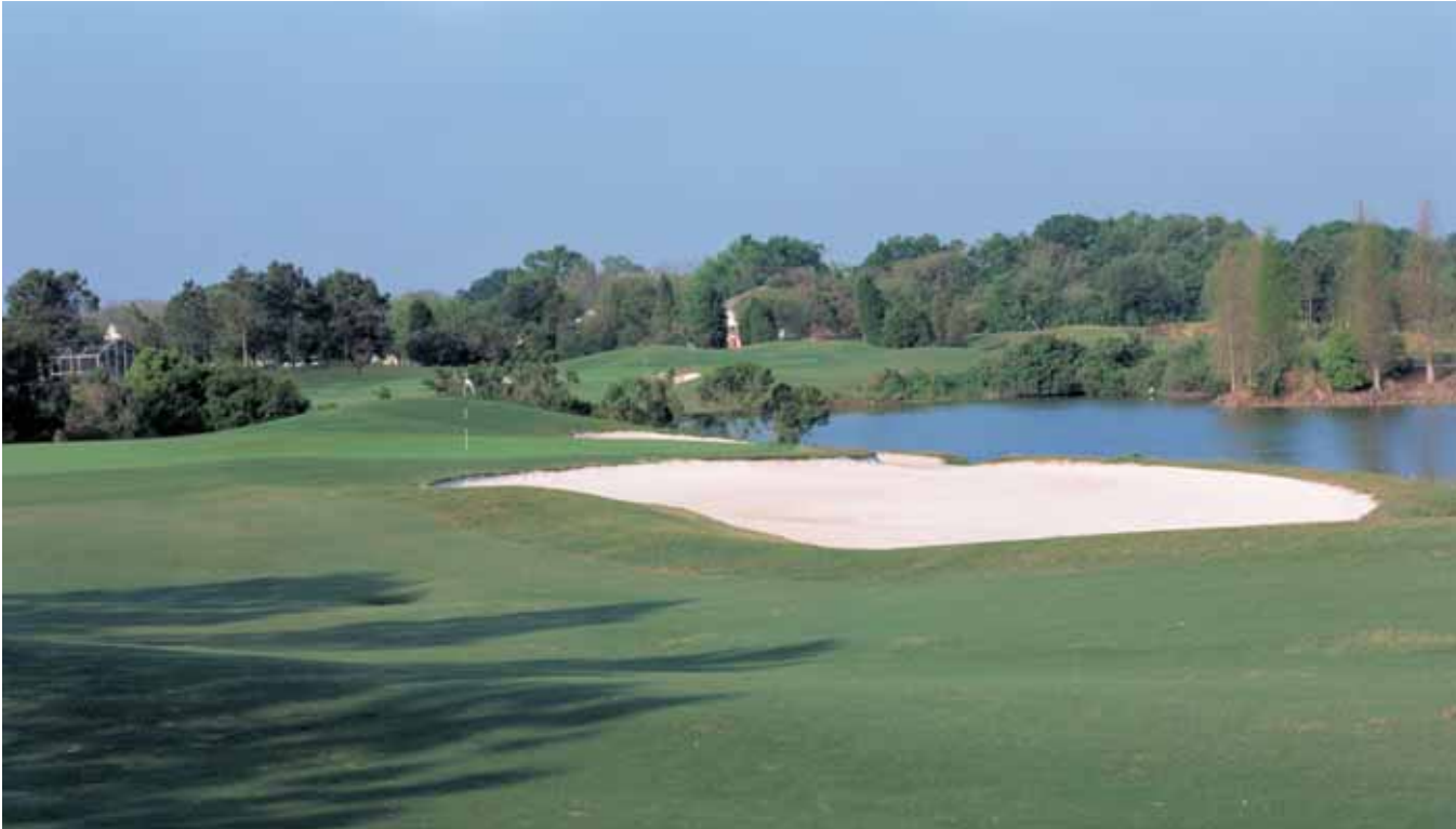
A scenic view from the 15th green with No. 12 in the background.