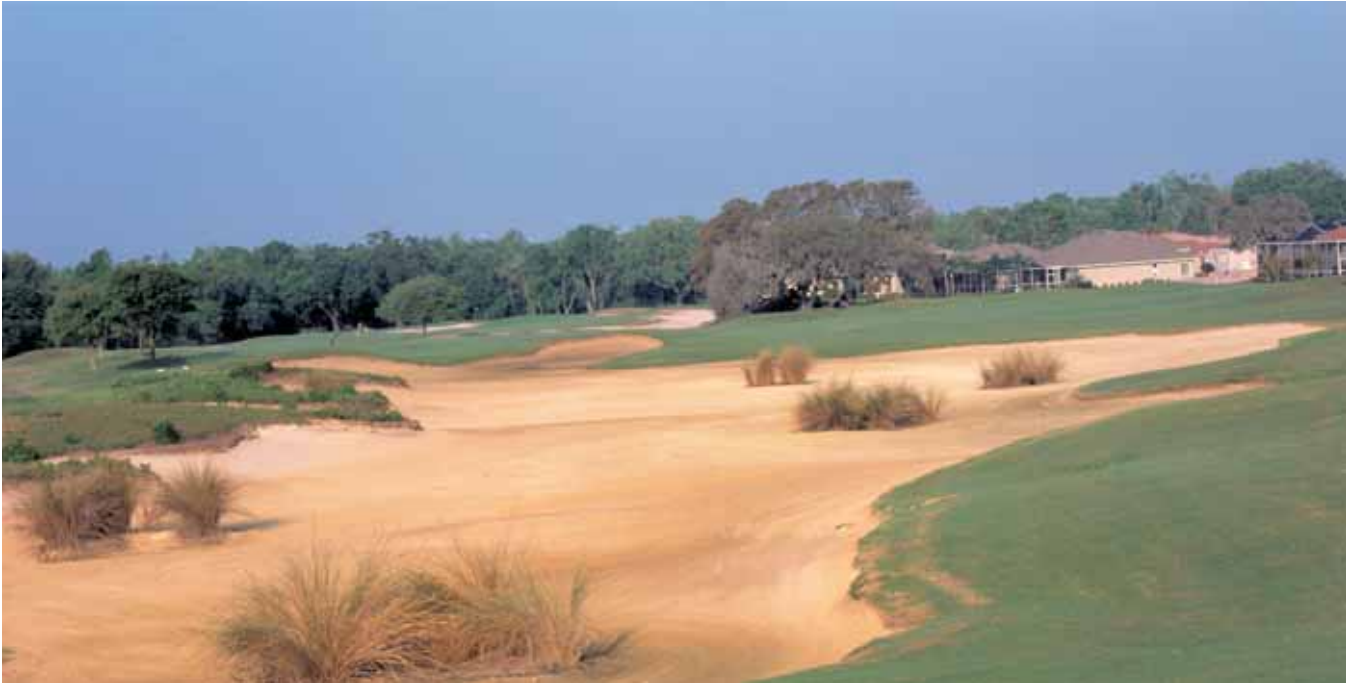
The 526-yard fifth hole plays along one of the three large waste areas on the course.

with regular soil sampling and custom fertilizer applications. Another big issue is the irrigation