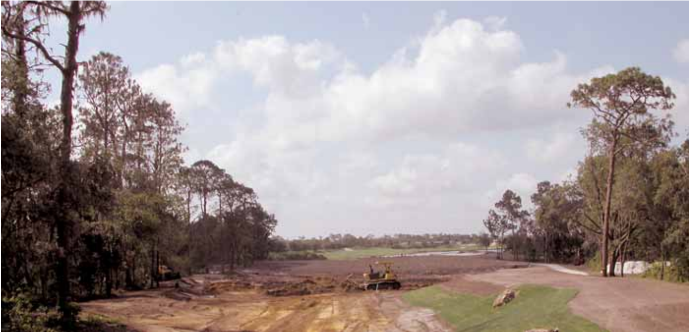
A large stormwater retention area is part of the redesign of the 17th hole. The tee tops and fairways have been sprigged and erosion-prone areas are being sodded.

bunker was so close you often had to lay up, not always a good strategy move on a par 5. As it