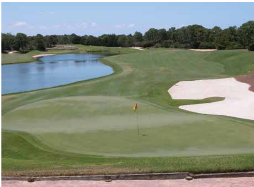
TifEagle ultradwarf on No. 18 green at Loblolly Pines G. C. in Hobe Sound.

“If you lose control of your clippings yield, which is one of my signals, you’re done. It can affect thatch production and greens speed. I also use tissue sampling as a barometer to make sure my nutrient levels stay in line. I have learned to correlate the sample values with the appearance and performance of the grass. We tend to keep them leaner in the summer (4.0) so they don’t thatch up so fast and in the winter we monitor them at (4.7) while 4-6 is the recommendation overall ideal. We feed them with 2-5 gallons of Gary’s Green depending on tissue-sample numbers and may add some soluble N as needed. I learned this regimen on the Champion and it has worked well for me on the TifEagle.”