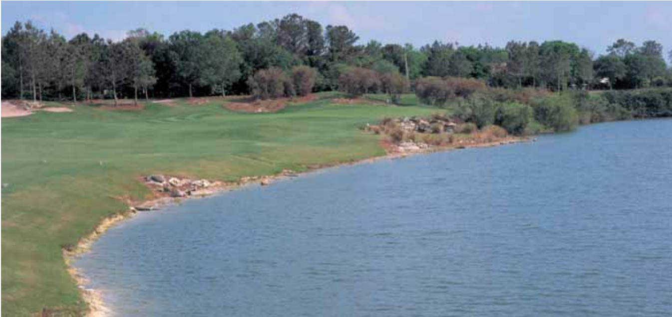
The second half of the double-dogleg, 514-yard, 17th hole. The first half of the hole is being redesigned to enhance the playability and strategy of the tee shot.

remarks, "They say you can't go home again. Well maybe you can go home with a different view. I reached a lot of my career goals at an early age, but