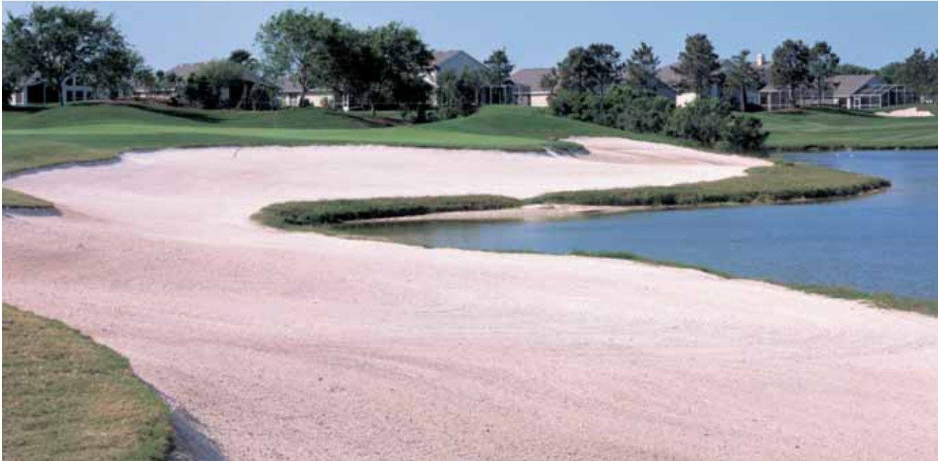
A different view of the par-4, 431-yard 15th hole indicating why it is the number-two handicap hole.

Community Development District Board or working with the Ridge GCSA on the Lakeland