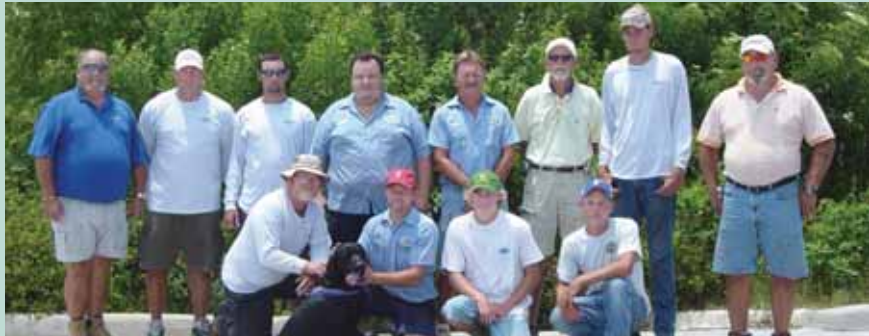
Eaglebrooke Golf Course Maintenance Staff.