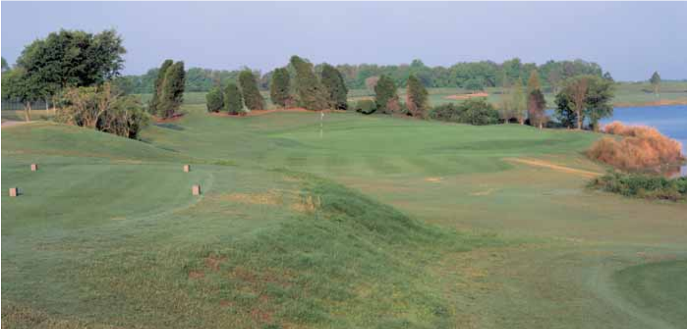
The par-3, third hole borders one of seven interconnected lakes on the course. Note the guy ropes on the trees behind the green - necessary reminders of the 2004 hurricane season.

To the club's credit they replaced the old equipment when Puckett came on board so