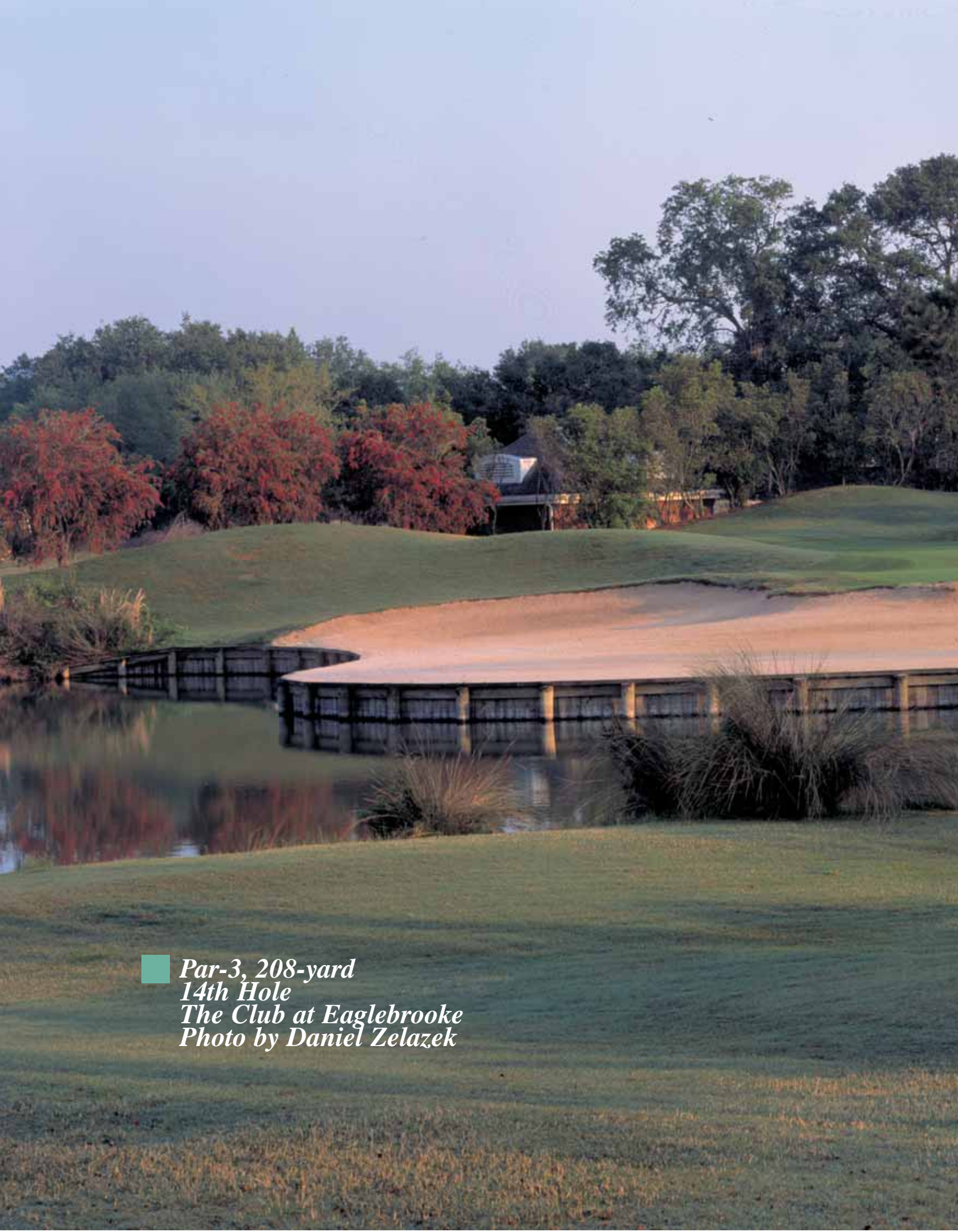
Par-3, 208-yard 14th Hole The Club at Eaglebrooke