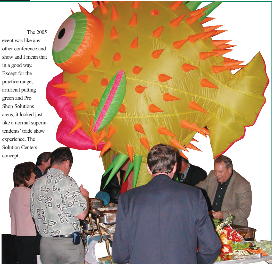
Colorful decorations created a festive tropical island backdrop for the 2005 FGCSA Reception.

The 2005 event was like any other conference and show and I mean that in a good way. Except for the practice range, artificial putting green and Pro Shop Solutions areas, it looked just like a normal superintendents' trade show experience. The Solution Centers concept