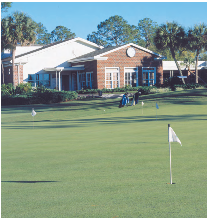
A flawless putting green; the perfect place to practice.

In his overall pest-management program, Keene treats all curative applications of chemicals with a spot-treatment approach. The only large-scale applications are with Barricade and Ronstar pre-emergent herbicides applied in the fall and spring to prevent ryegrass or crabgrass and goosegrass germination, thus reducing