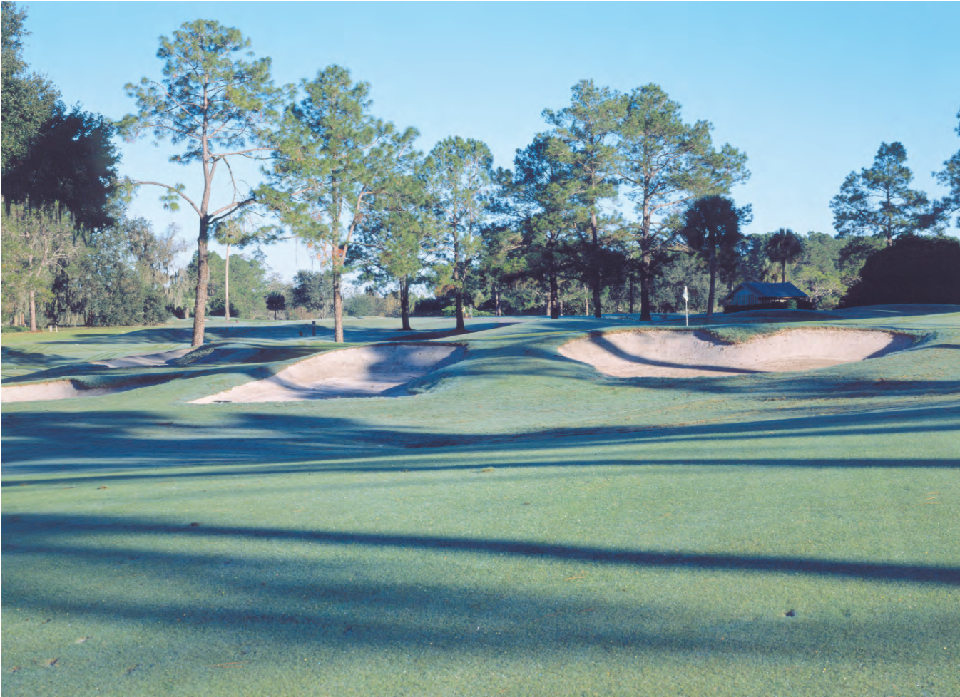
Early morning shadows across the 10th green.

grass, one of the oldest varieties used on golf courses. There are a couple of Tifway 419 and Greg Norman GN1 fairways as well. The greens are 11-year old Tifdwarf with some of the typical off-type patches in them.