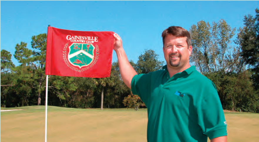
Buddy says, "Don't worry, boss. The greens aren't brown; that's just the new seed on the ground."