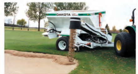
440 – Bunker Fill