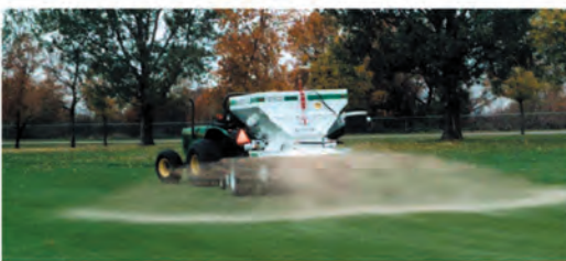
440 – Spread