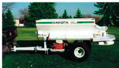
410 – Pull Type