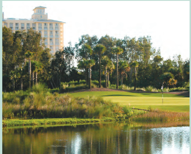
Accommodations for the event were provided by Hyatt Regency Hotel seen here overlooking Raptor Bay's 6th hole.