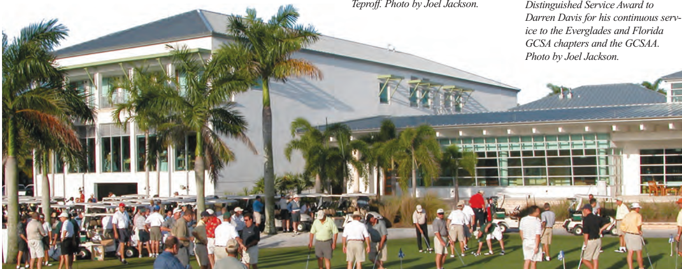
Poa players gather on the putting green to meet and greet before the shotgun start. The tournament was sold out early this year.