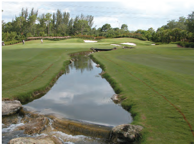
The 2004 G.C. Horn Endowment Tournament was held at the beautiful and challenging Estuary G.C. at Grey Oaks in Naples.