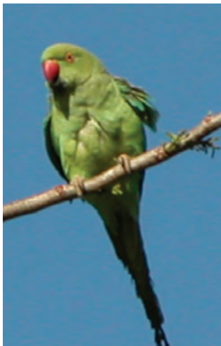
One of the attractions of playing in the Poa Classic is not all the birdies are on the greens. The Rose-ringed Parakeet is a common sight on the Naples Beach Club G.C.