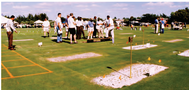
Field trial plot tours at the South Florida Expo covered everything from biocontrols to weeds.

We are glad you came, hope it was informative and enlightening and most importantly, we hope to see you again next year with a friend under each arm.