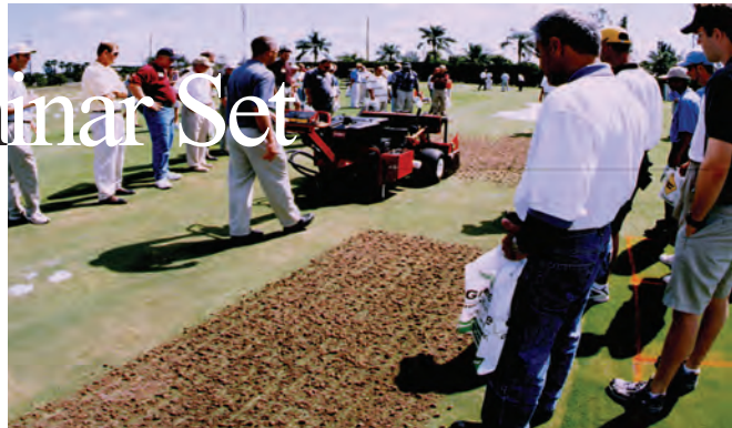
Onlookers check out the newest aerifier from Toro during the equipment demonstrations at the South Florida Expo.

thick with muffled sounds of gas and diesel engines and, at the turn of a key, the equipment demonstrations featuring shiny new machines were under way. There were all types, shapes, sizes and applications. I'm with Tim the Tool Man – More Power (vaaaarrrroom)! At the same time the doors opened for 40 booth displays under the big top tent. Every facet of the turfgrass industry was on display: fertilizers, chemicals, irrigation supplies, and rental equipment.