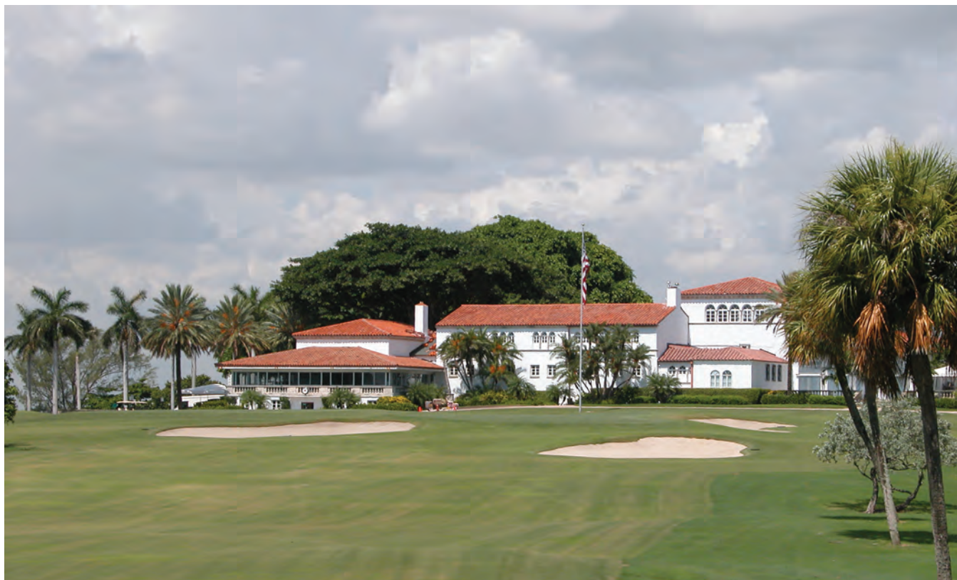
View of the 18th hole and Indian Creek clubhouse.