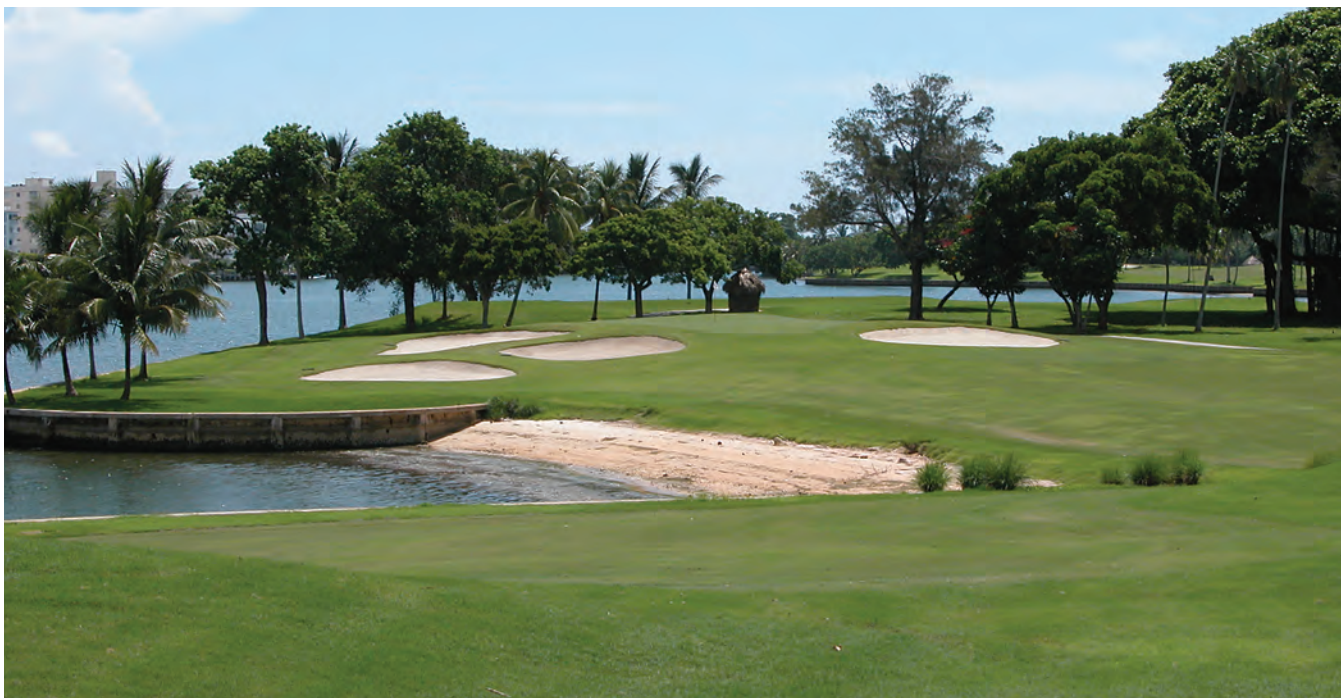
The beach along the par 3, 12th hole is preserved as a reminder that seaplanes once ferried people to the island.