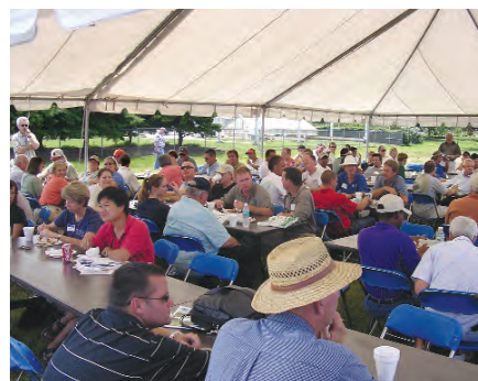
The crowd of 200-plus enjoys lunch at the Field Day.