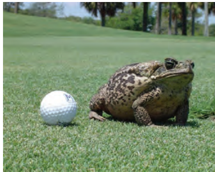
Imported in the 1930s to control sugar cane beetles, the Giant Toad is a threat to the native frog populations in South Florida.

Bufo marinus is a tropical species that if