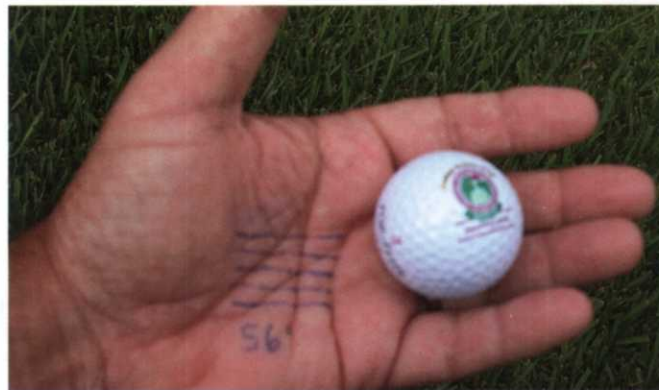
Ridge sand wedge.

Captain Ellis gave early indications of how the Ridge Rules are used to alter the normally accept-