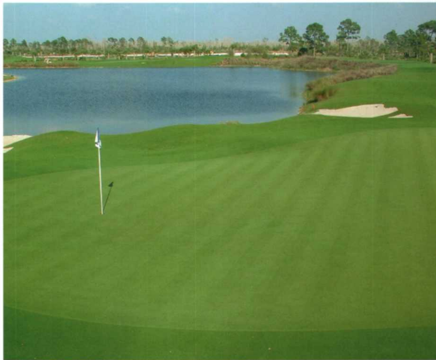
The Crown Colony G&CC has SeaDwarf paspalum on the greens and Sealsle1 paspalum everywhere else.

Although Crown Colony was not intended for brackish water irrigation, the effluent water source had some salinity issues. Seashore paspalum's salinity tolerance was the