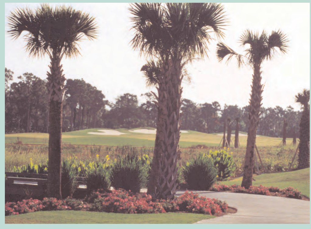
Second Place - "Bridge Crossing" by Jason DiMartino, Audubon C.C., Naples.

Category 2 - Formal Landscaping: includes annuals and ornamental shrubs and trees planted in formal beds on the course or club entrance.