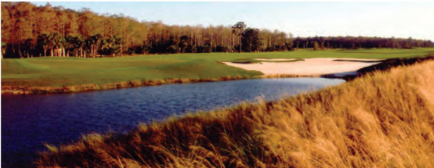
The Tom Fazio-designed Sabal golf course is located at Bonita Bay East on a site that includes 895 acres of cypress wetlands, 190 acres of pine flatlands, lakes and hundreds of Florida's state tree, the sabal palm.

environmentally responsible development, holds the distinction of having created more Audubon International Signature Sanctuary golf courses than any other company in the world.