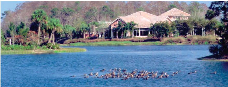
The Brooks' restoration project returned a watershed flow-way to its natural state and rejoined 91 acres of wetlands, creating a nesting and roosting area for native birds.