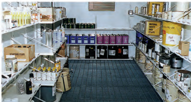
Building equipped with shelving for storage of bottles, buckets, bags, and boxes of chemicals and other materials.

Safety Storage's prefabricated buildings let you realize substantial savings over the cost of permanent buildings,