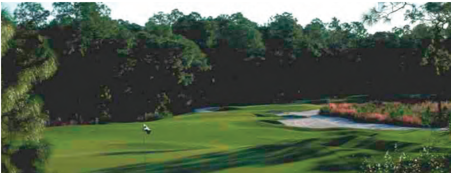
Bonita Bay's Club at Mediterra won the National Private Club Environmental Leader's in Golf Award for 2002.