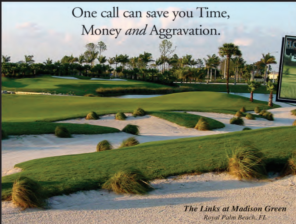
The Links at Madison Green Royal Palm Beach, FL

One call can save you Time, Money and Aggravation.