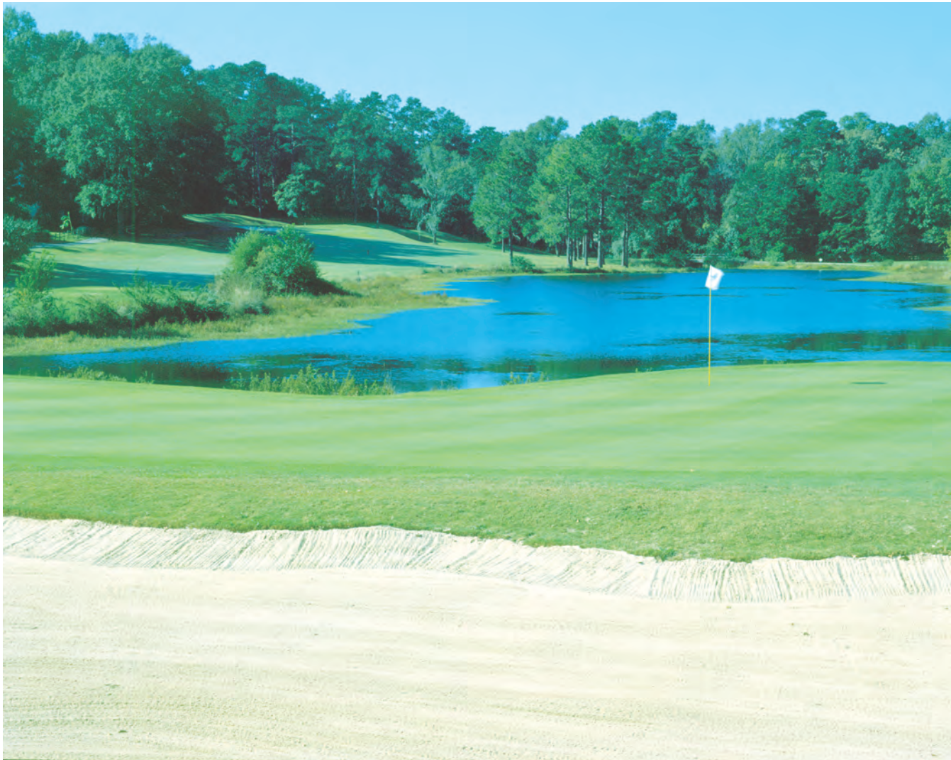
View from behind the 154-yard, par-3 12th hole. The tree-lined 15th fairway is on the left.

course property is in better shape than the water coming in, and we want to improve those numbers. We are investigating lake aeration systems and ways to further minimize any impacts from our maintenance operations utilizing aquatic plants and best management practices.