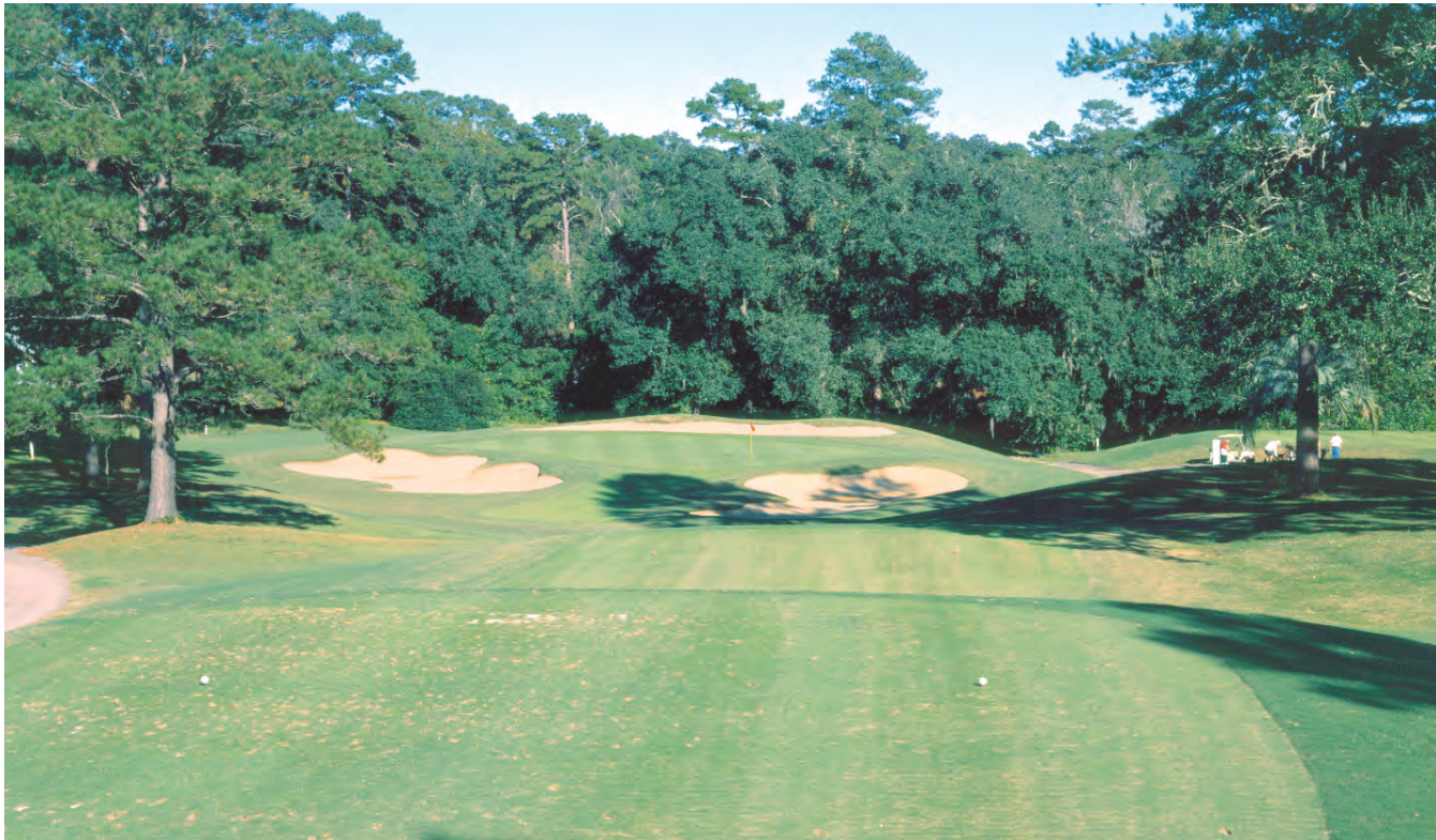
Variable pin placements and the elevation change on the 164-yard, par-3 8th hole make for fun and challenging golf.