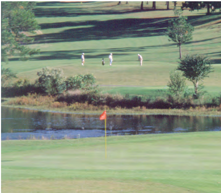
View from the 11th green across the lake to the 14th hole. Color coded flags: red (front), white (middle), and blue (back) help golfers with yardage and pin locations.