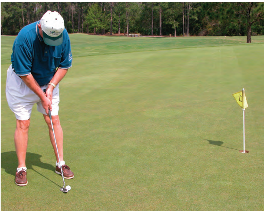
Putting surfaces are the most intensely managed pieces of real estate on the golf course.

Like most superintendents today, Ondo uses a combination of granular and liquid fertilizer applications to feed the turf. During normal operations he likes to apply a granular 10-1-10 from Howard Fertilizer and he switches to Harrell's 18-2-18 during transition. His liquid arsenal includes alternating blends of potassium nitrate at 10 lb./acre, 15-0-0 at 4 oz./1000 sq. ft. and a product called NPK also at 10 lb./acre.