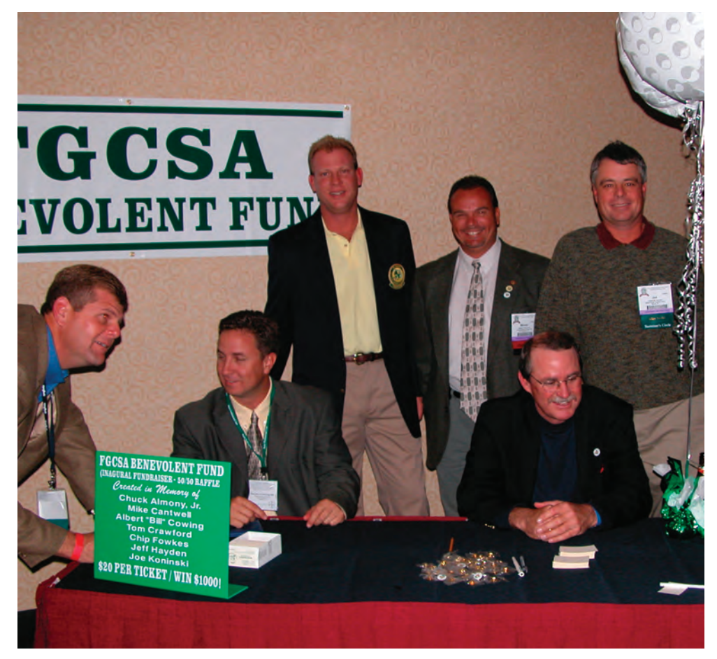
The newly enacted FGCSA Benevolent Fund got a great start with over $3,000 in donations at the FGCSA Reception in Atlanta.

USGA, and National Golf Foundation, and McGladrey Pullen, a CPA firm. It was an informative session for key decision-makers at golf clubs. The TCGCSA board also voted to donate funds to support the South Fork High School turf program and to donate $5,000 to the Florida Turfgrass Research Foundation. The board also approved a $5,000 donation to the Challenger School for disabled children to help with the cost of