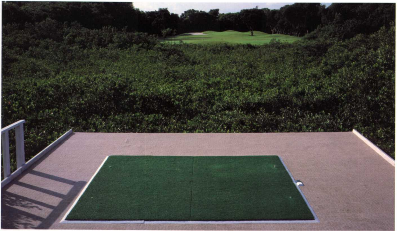
Ocean Reef Harbor Course No. 4 tee platform in the mangroves.