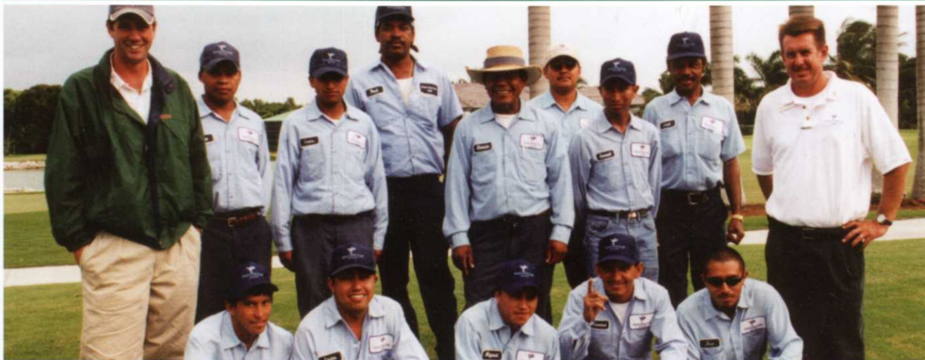
Dolphin Course crew.