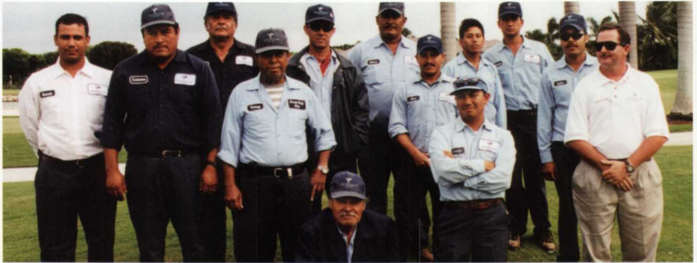
Harbor Course crew.