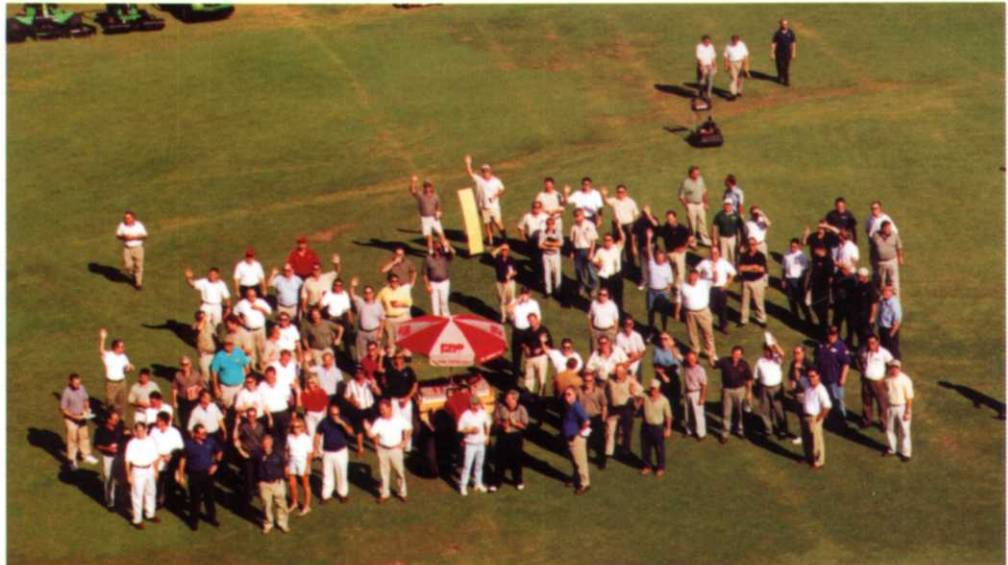
Aerial view of the Suncoast Supplier Appreciation Day attendees from 60 feet up courtesy of Save-On Enterprises' bucket truck. Equipment and product displays ringed the driving range.