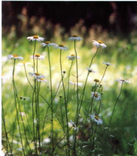
Lyne Page, The Habitat @ Valkaria