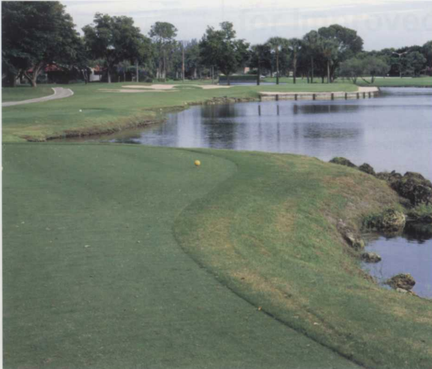
Steep rocky shorelines like No. 18 West make grooming lake banks more time consuming.

downtown Boca Raton. The 1700-unit community of condominiums and villas borders the 36 holes of the East and West courses, which, in most cases, are the back yards for the residents.