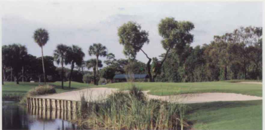
Bullrush and bulkhead on No. 6 West are just two of the ongoing projects at Boca Lago.