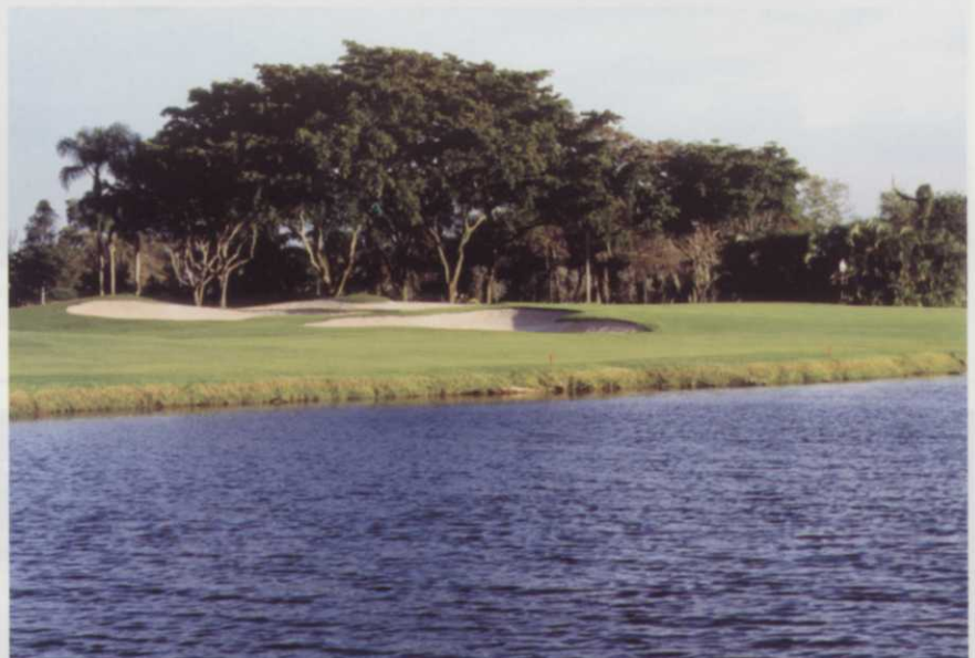
The lake guarding No. 4 East is just part of the 50 acres of lakes at Boca Lago.

Because it is a residential setting, trees and shade are inevitable. Court says one of the biggest challenges is managing turf around Ficus trees. "The Ficus is a favorite South Florida tree, but when they get big, the shade is so dense, the grass just won't grow. In the shadier areas we have been experimenting with several varieties of zoysiagrass. Over the past six years we've planted Cashmere, El Toro and Greg Norman zoysia. So far Cashmere has worked the best for us."