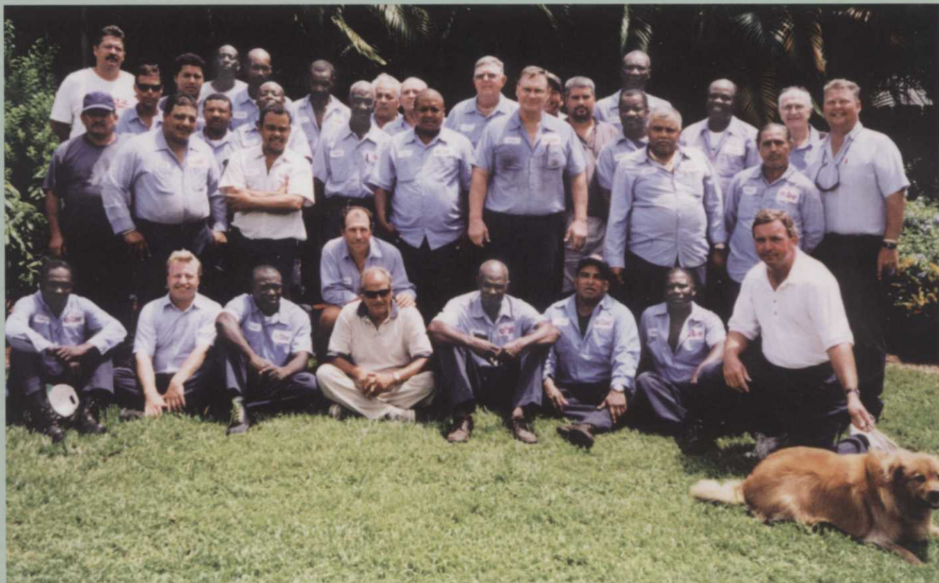
Boca Lago Country Club