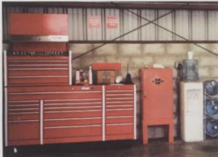
Top quality and specialized tools are bought and owned by Hawk's Nest.

equipment items have the operators' names printed on them, making each operator responsible to clean and check the oil on his assigned equipment. A board in the break room allows operators to write down any