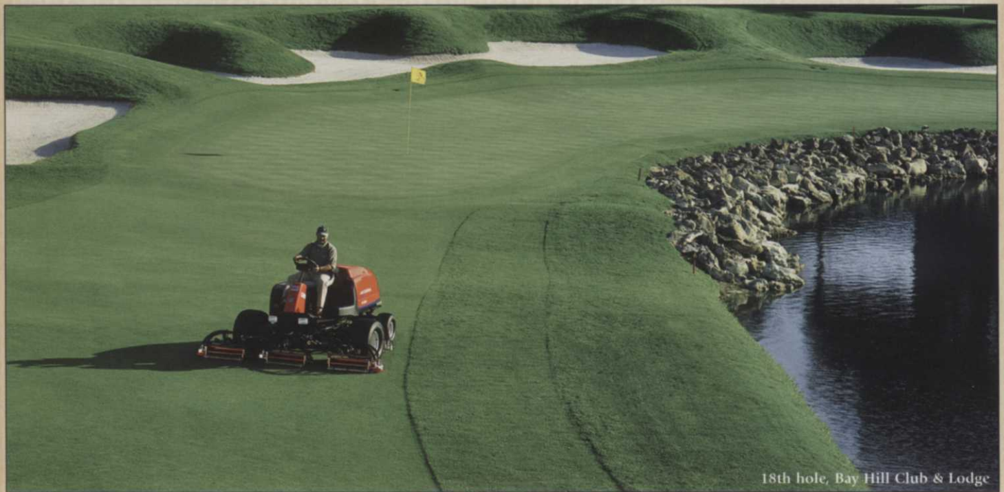
18th hole, Bay Hill Club & Lodge