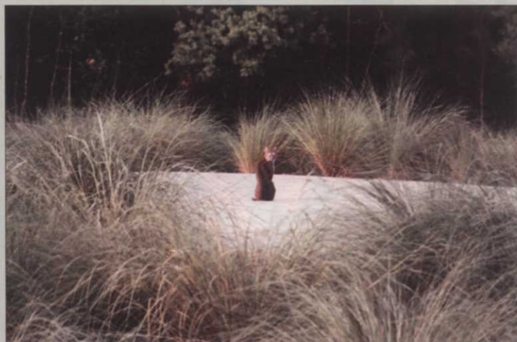
Category 1 — Wildlife on the Course. Bobcat in the bushes. Willoughby G.C., Stuart, FL.

Category 1 - Wildlife on the Course: includes mammals, birds, reptiles, amphibians.