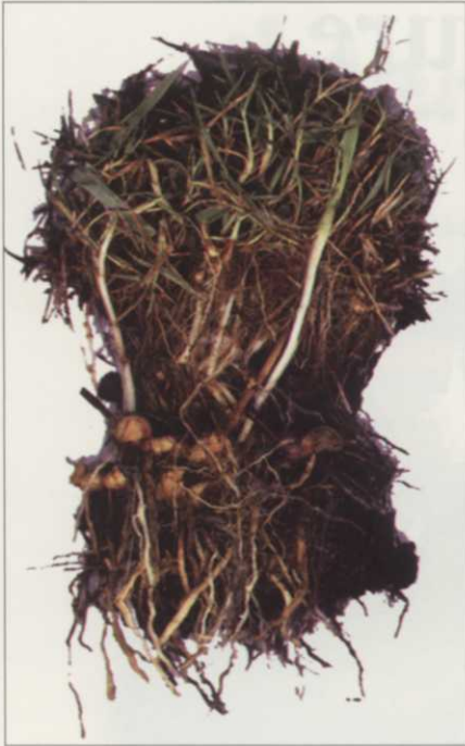
Torpedograss cup-cutter plug showing extensive tuber and rhizome mass. Most of the plant is below the ground.

TopPro Specialties, but following corporate reorganization, it is currently handled by BASF.