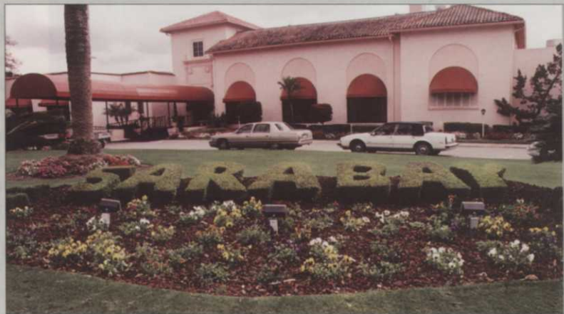
The Sara Bay topiary logo was transplanted letter by letter from the nursery area where they were grown in and shaped. According to the local extension agent, constant pruning of these Shillings hollies to one size can weaken the plants and make them susceptible to disease. The only cure is periodic replacement.