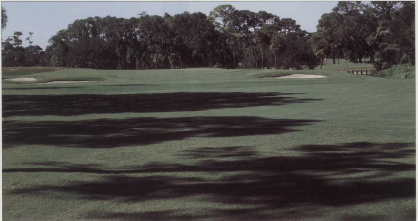
With the front of the green wide open, the 387-yard 15th hole invites a classic bump-and-run approach shot.