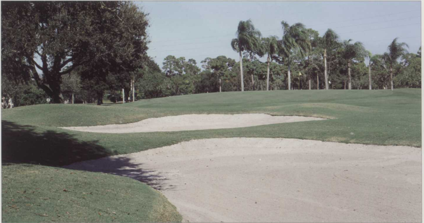
The green on the 391-yard, par-4 11th hole is a good example of the famous Donald Ross "dome-shaped" greens.

AERIFICATION + PLUS, INC. TURFGRASS AERIFICATION AND ROOT ZONE MANAGEMENT