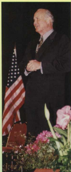
Retired U. S. Army General Norman Schwarzkopf, Jr. was the keynote speaker at the GCSAA Conference's Opening Session on Wednesday night.

"You can forget all these principles if you only remember these two rules. Here are the two secrets to 21st century leadership. Rule 13: When placed in command, take charge. Rule 14: Do what's right."