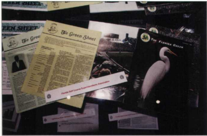
A series of historic displays throughout the convention center showed the evolution of golf course equipment and affiliated chapter publications. The FGCSA had a prominent display of milestone issues of the Green Sheet and The Florida Green and its parent publication the South Florida Green.

the shuttle buses was the walkway to the classrooms festooned with banners hanging over the aisle. Each banner bore the name of a