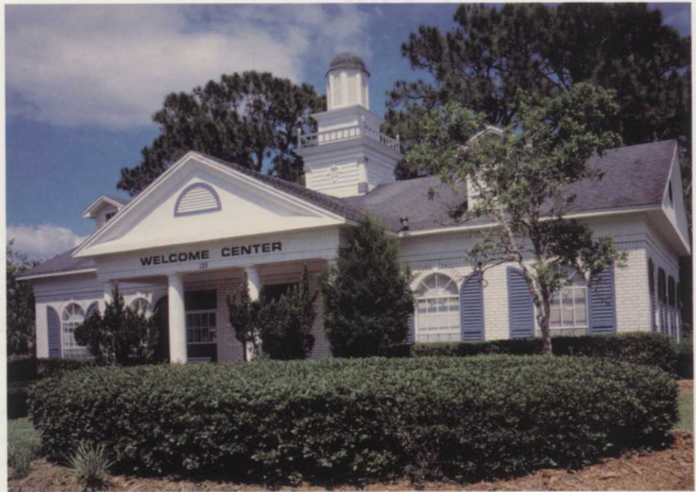
Great Outdoors Welcome Center.