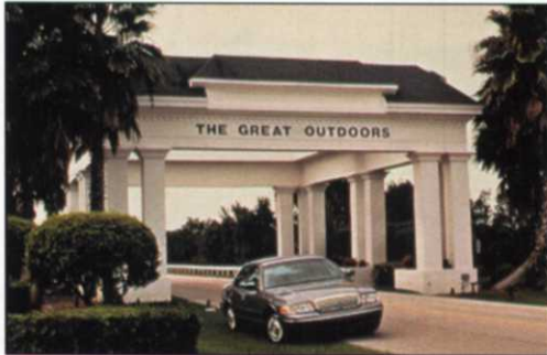
The Great Outdoors Golf Resort, Titusville

New Orthene® 97 is proving to be a popular pest-control choice on golf courses throughout the South. Here's what three Florida golf course superintendents have to say about new dust-free, low-odor ORTHENE 97: