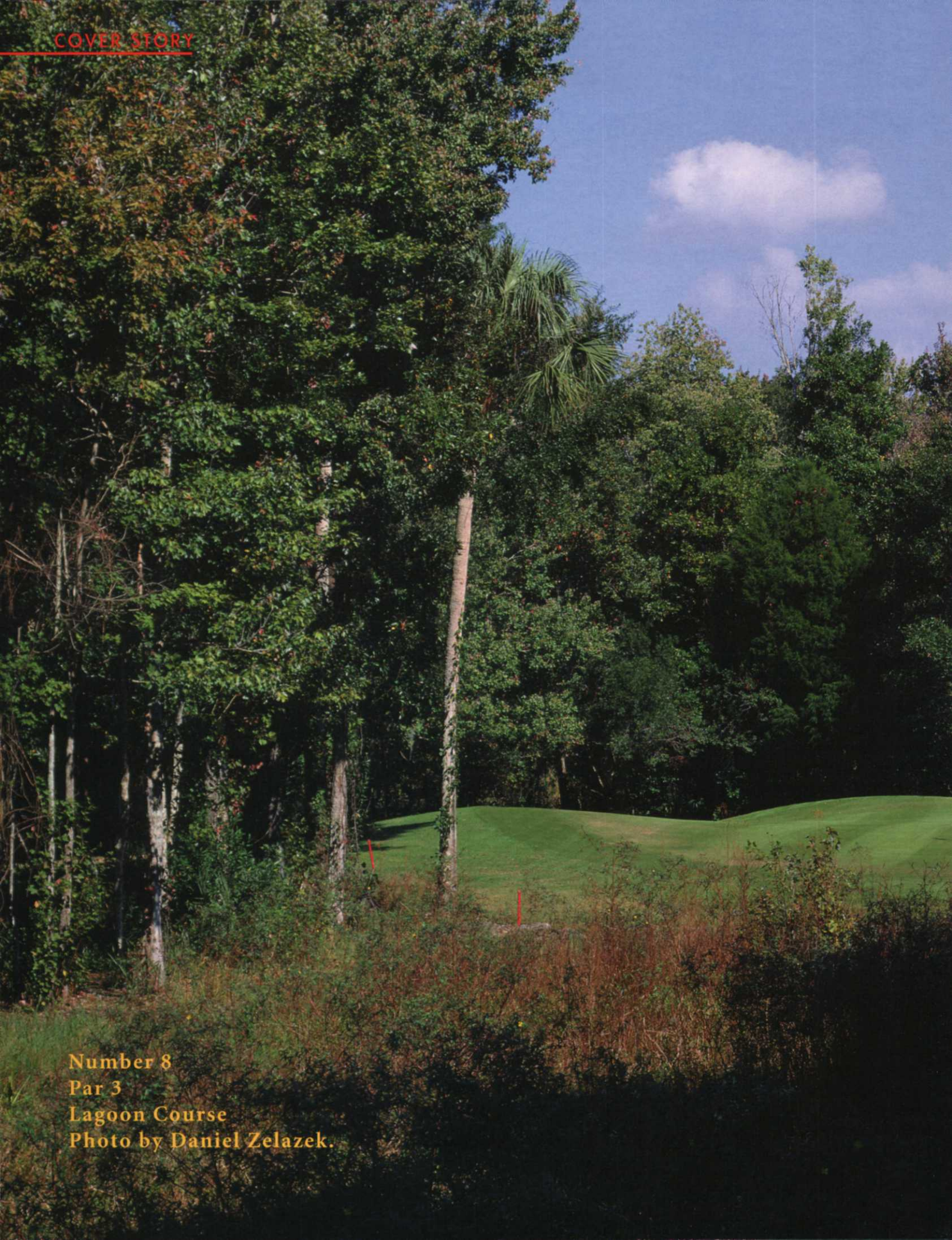
Number 8 Par 3 Lagoon Course