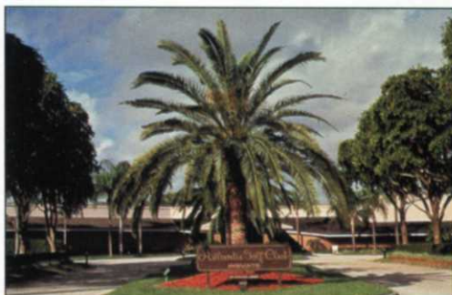
Atlantis Golf Club, Atlantis

"I've really liked ORTHENE, and I've used a lot of it over the years. What I like about ORTHENE 97 is the smell. It is much better. But the most noticeable difference is the elimination of dust. The resealable bags are perfect. You don't have to worry about it spilling or making the chemical storage room dusty."