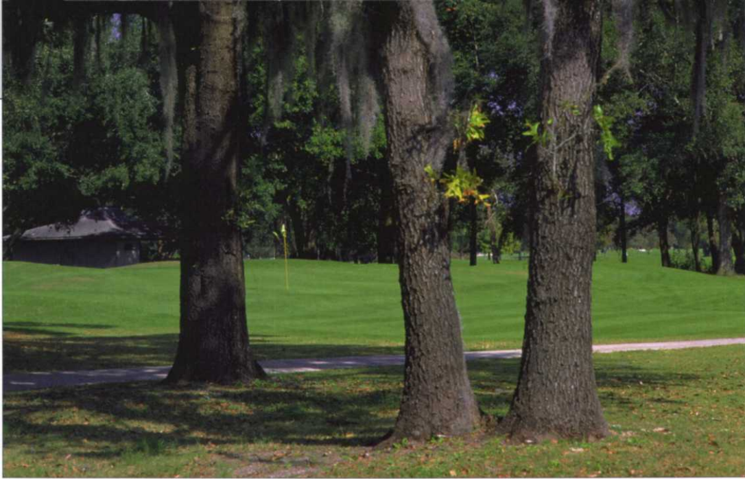
Number 7 Lagoons Course, Plantation Inn Golf Club.