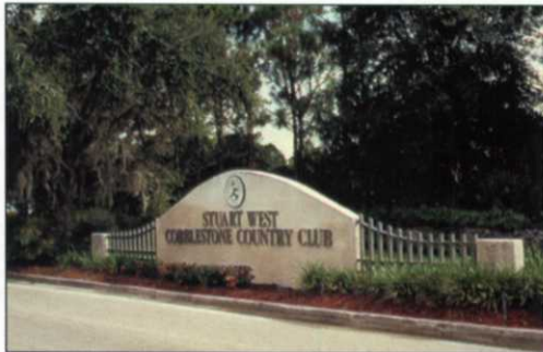
Cobblestone Country Club, Palm City

"Somebody did their homework when they created this product. It's a lot neater in my chemical room because of the resealable bag. My technician finds ORTHENE 97 much easier to work with because of the low dust. I've had my crew mention that the odor is less, and the members have also noticed less odor with this product."