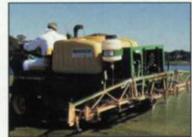
From tee to green, ORTHENE 97 is the new choice at Cobblestone Country Club.