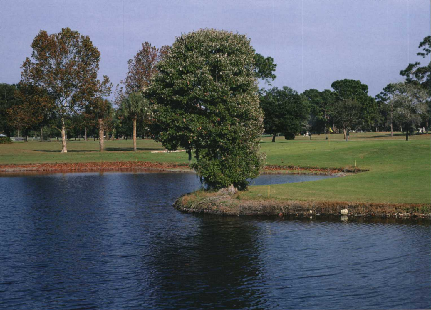
Number 4 on the Lagoon nine. Photo by Daniel Zelazek. The water hazards on the course are interconnected and can rise and fall with the nearby Crystal River. Photo by Daniel Zelazek

away from slow-release fertilizers. I watch my grass clippings caught by the greens mowers and I apply light rates of soluble fertilizer as needed. Bermudagrass likes to be fed. The days of lean and mean are over. Consistent, pleasing and playable are my goals.”