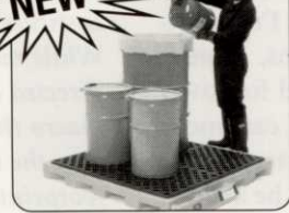
Spill containment products for shop of chemical rooms