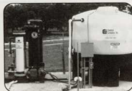
Wash Rack Systems – •closed loop •sewer discharge