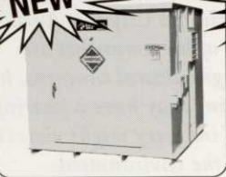
Complete self-contained chemical buildings