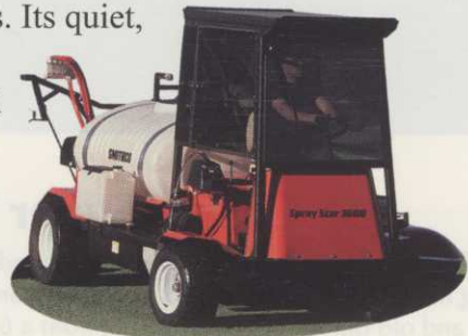
SPRAY STAR 3000 300-Gallon Capacity

The Spray Star 3000. Our big-capacity sprayer for those big jobs and big areas. Its quiet, Ford, water-cooled engine delivers plenty of power for its big payload - and its automotive-type steering gives it the maneuverability you like. With many operator safety features, including a filtered-air cab.