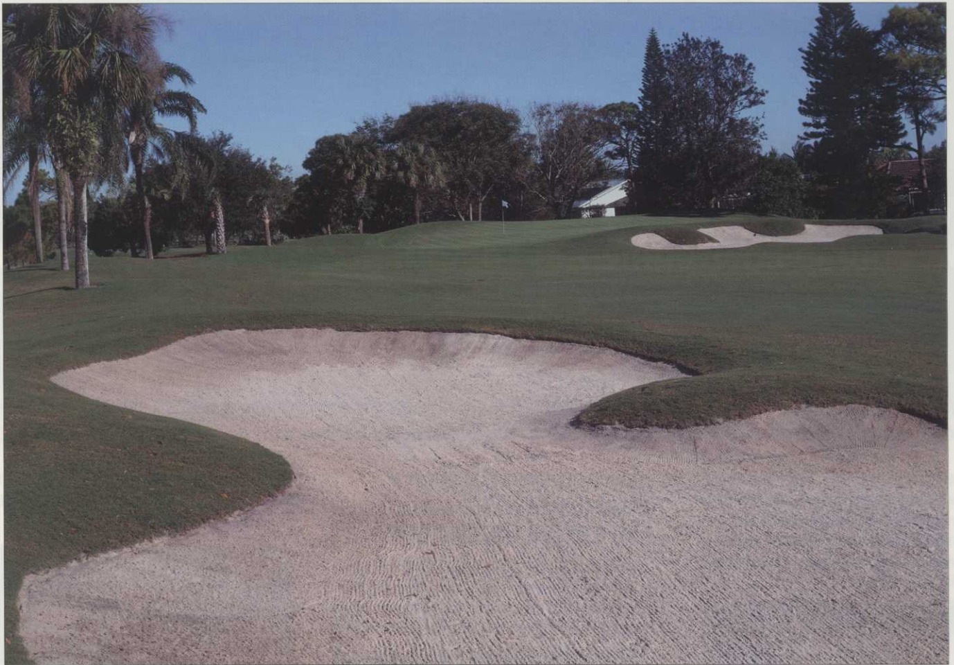
46 manicured bunkers influence tee shots and guard green's approaches on the 1990 Charles Ankrom redesign of the course. Hole #11

existing tees and built additional tees on the course to offer more teeing ground options to accommodate the various skill levels of the members.