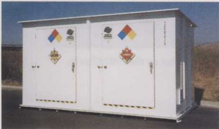
Safety Storage prefabricated, weatherproof, relocatable buildings are available in a wide variety of sizes and storage capacities.

It starts with our knowledge of golf course pesticides, insecticides, herbicides and other chemicals and extends to our wide range of buildings, structures, and spill containment products designed for maximum safety and compliance, while keeping your liability to a minimum.