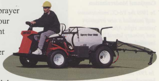
SPRAY STAR 1000 110-Gallon Capacity

Our All-New Spray Star 1000. The turf sprayer that will take the worry out of damage to your most important turf areas. With its very light weight and extra-soft turf tires, its psi adds up to only seven. Hydraulic drive and power steering make it particularly maneuverable and its spray controls will give you the precision you want and need. The spray tank has a very low center-of-gravity and profile - and carries a Lifetime Guaranty. Only from Smithco.