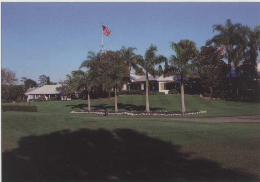
Yacht & Country Club's clubhouse seen from the 10th tee.

residents either lived on fairways or on waterways just a short drive or cruise from the Intracoastal Waterway and Atlantic Ocean. Thirty-three years later the club has matured and taken advantage of modern golf design and maintenance technology to keep its playing conditions up to par for its members and competitive with the booming golf market in the area.