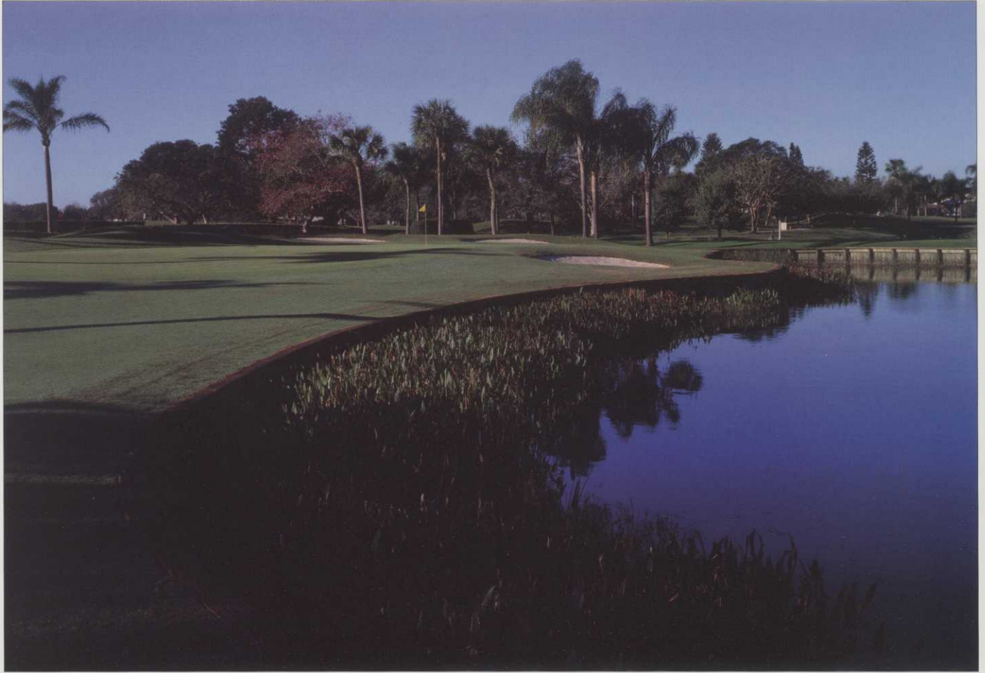
One of many success stories at the Y&CC of Stuart is the use of aquatic plantings, like these on the 9th hole, to improve water quality and attract wildlife.