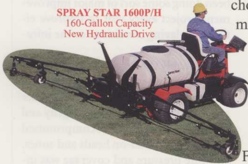
SPRAY STAR 1600P/H 160-Gallon Capacity New Hydraulic Drive

The Spray Star 3000. Our big-capacity sprayer for those big jobs and big areas. Its quiet, Ford, water-cooled engine delivers plenty of power for its big payload - and its automotive-type steering gives it the maneuverability you like. With many operator safety features, including a filtered-air cab.