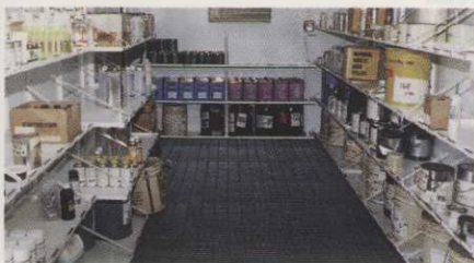
Building equipped with shelving for storage of bottles, cans, buckets, bags, and boxes of chemicals and other materials.

Environmental controls and accessories are available to meet special needs such as fire suppression systems, audible and visual alarms, ventilation systems, shelving, heating and air conditioning.