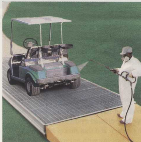
The Turnkey Washwater Treatment System is an above ground, closed-loop, self-contained unit with zero discharge.

Wash and clean pesticide and fertilizer spray equipment, mowers, golf carts, and other golf course equipment while eliminating hazardous wastewater discharge and avoiding groundwater contamination.