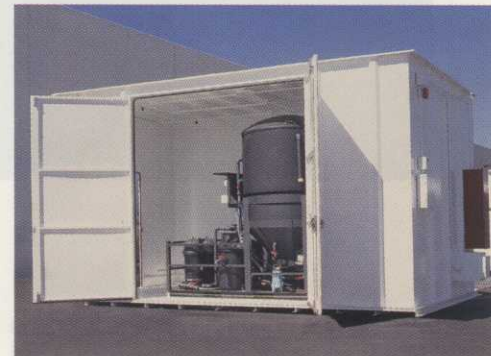
The Turnkey Washwater Treatment System is an above ground, closed-loop, self-contained unit with zero discharge

eliminating sewer discharge fees and permitting fees. Stops algae build-up and potential fish kills in ponds from washback runoff.