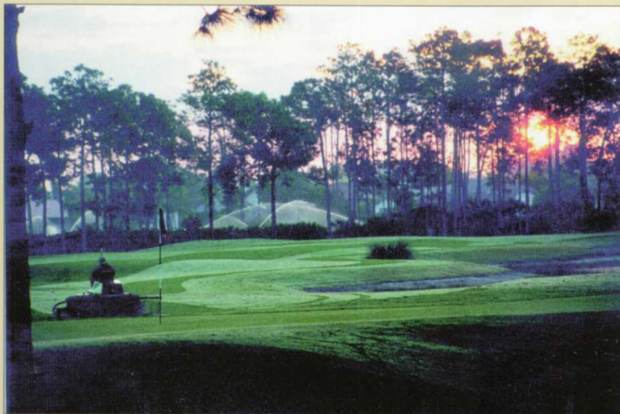
Scenic Hole Layout Includes sunrises, sunsets, frosts, storms and any other golf hole view.