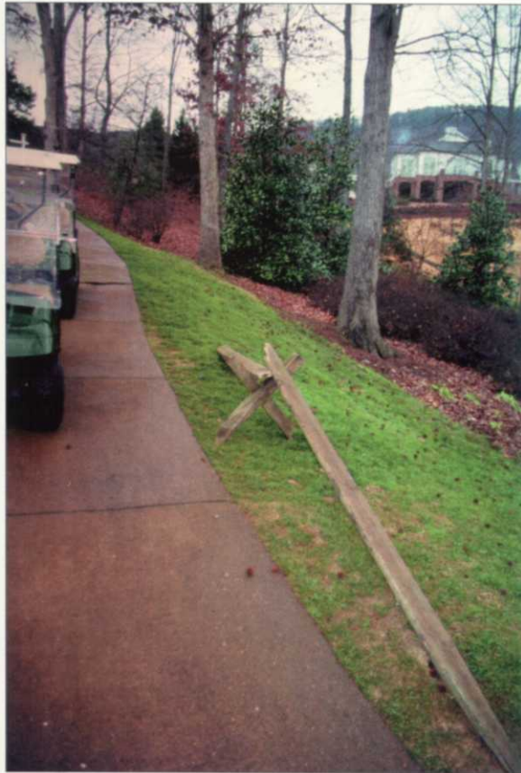
Natural-looking cart controls.

However, Kennelly knows that something is needed to prevent the damage that excessive golf car traffic can create. Therefore, he designed a natural-looking solution that is effective and blends in with the theme of the club. The wood that is used for the barrier is pressure-treated fence rails, purchased locally at a builder's supply outlet. The "X" that supports the rails is material cut from one of the rails and secured with galvanized screws to hold it in place. Once