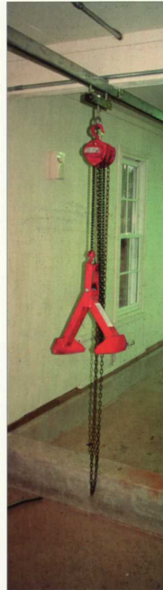
Darren J. Davis Olde Florida Golf Club 55-gallon drum lifter

Kennelly has several large poly tanks inside his pump station that are used to store fertigation material. He prefers to mix some of this material from 55-gallon drum products. The biggest problem with this was the obstruction created by the containment wall that was installed to separate the tanks from the pump station and the wet well. It created a potential safety issue for the employees that would lift the heavy barrels over this wall. Kennelly's solution to this was to hang a drum lifter with a manual chain hoist that enables a staff member to safely lift the material up an over the concrete divider wall.