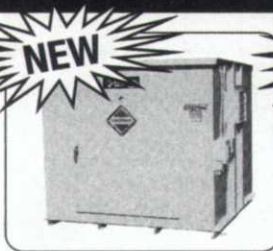
Complete self-contained chemical buildings

• Wash Rack Systems • Chemical Buildings • Spill Containment Products