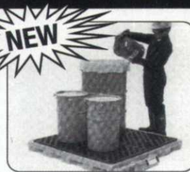
Spill containment products for shop of chemical rooms