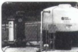
Wash Rack Systems – •closed loop •sewer discharge