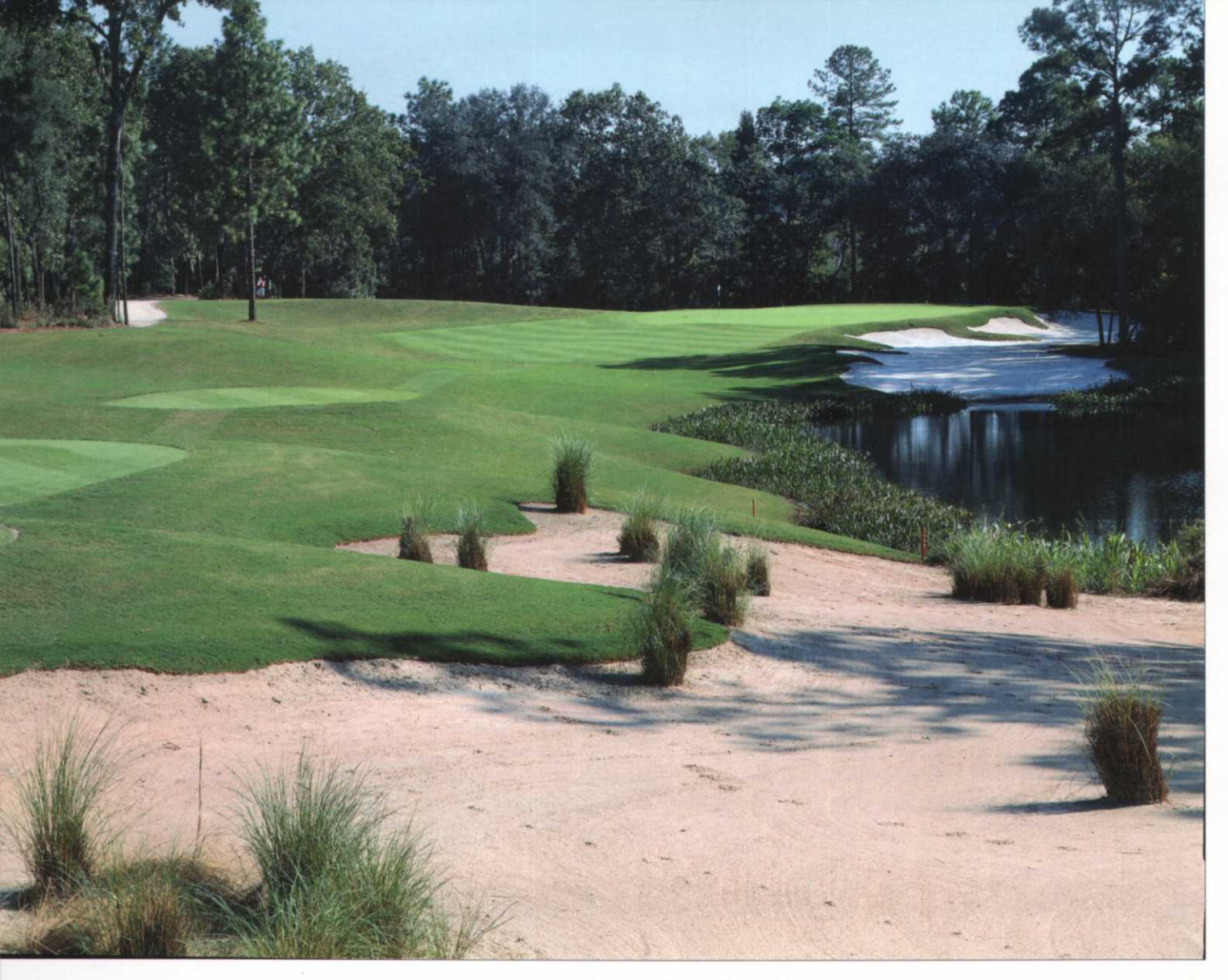
From this back tee location on the 8th hole, it's a 226-yard carry to the green.

Shooting par is a very good score and birdies are hard to come by. The course isn't tricked up. If you make a double bogey, it's because you didn't hit the ball.