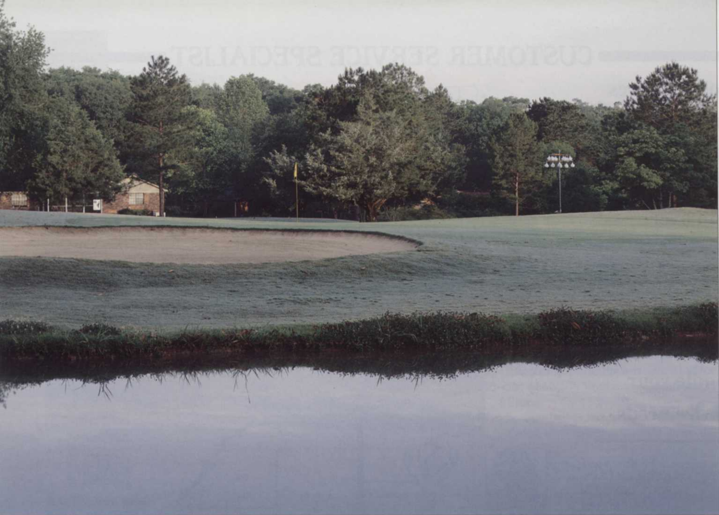
The first rays of sunrise begin to highlight the green on #1 South. Note the unusual purple martin house right of the hole.

“The aquatics will be a major part of the effort. All of the water hazards on the golf course are designed to capture runoff from the neighborhoods and act as stormwater retention ponds. Consequently, the water quality is of concern. We are testing the water and the sediments and taking an inventory of fish and invertebrate populations. We plan to aquascape the ponds to help improve the filtration of the runoff and to restock with fish and minnows as needed.”