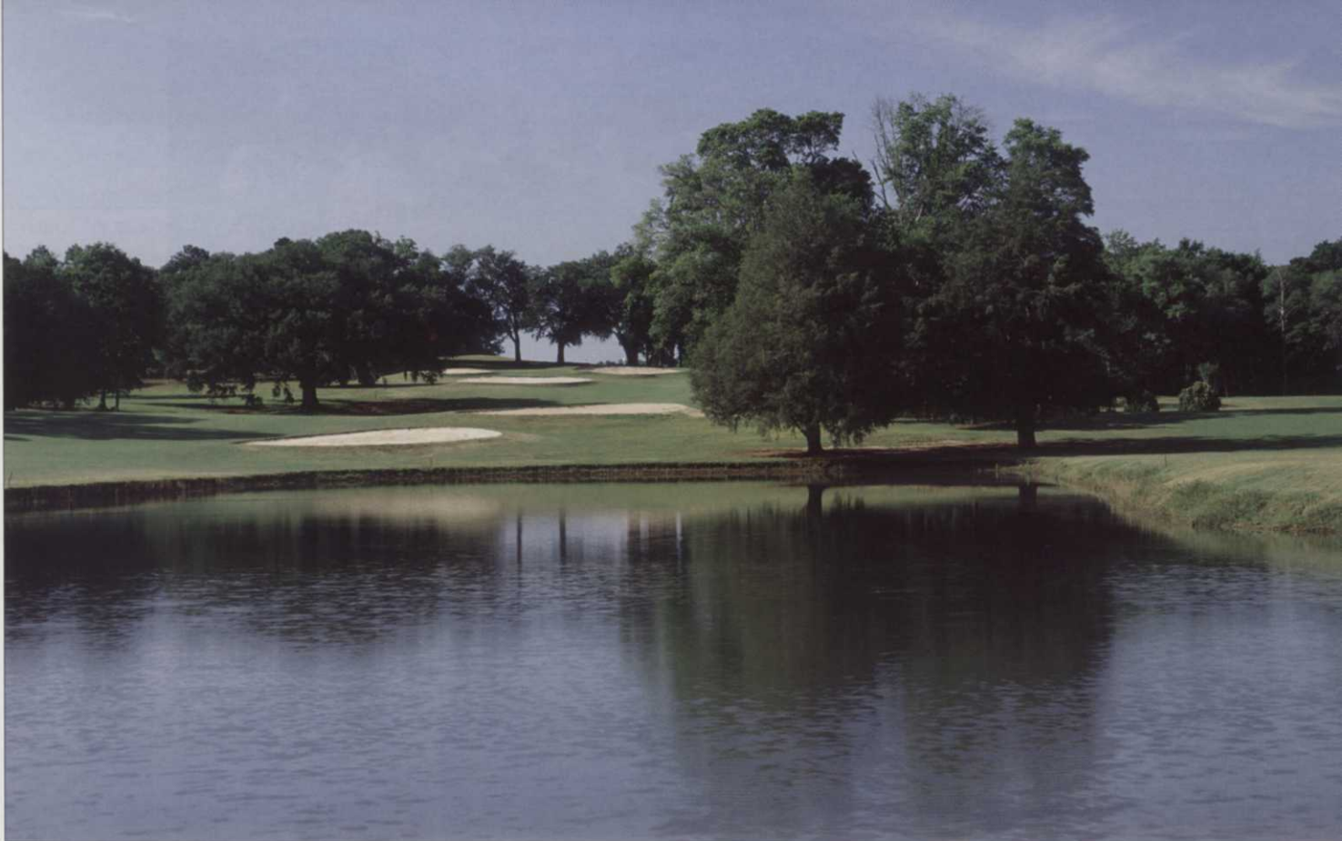
The pond that flanks the uphill 506 yard 5th hole on the South nine is part of the stormwater retention system for the residential area around the course.