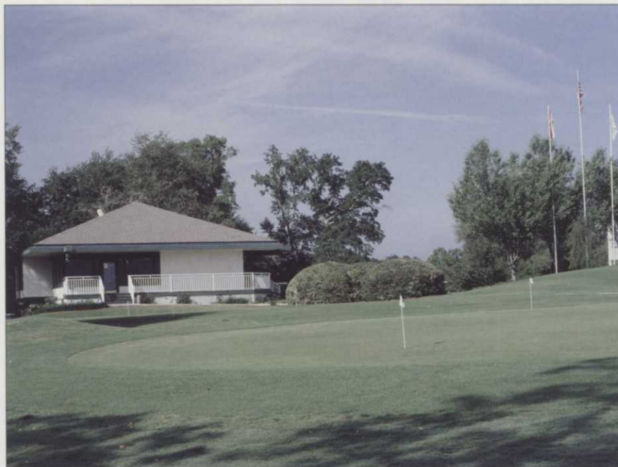
Killearn's Pro Shop and practice greens. The 39-room inn is to the right and behind the flagpoles.