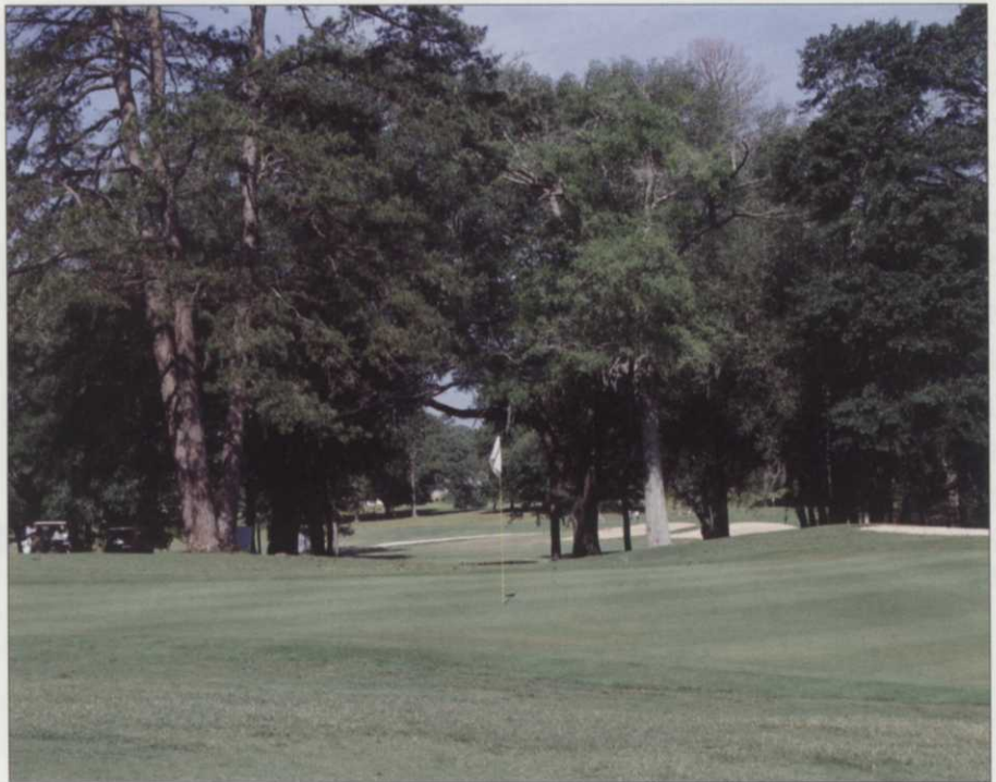
Mature pines and oaks frame the No. 2 South green giving the course a distinctive parkland appearance.

"And probably the worst tournament experience I ever had was at the Colonial Invitational one year. Everything was looking real good on the bentgrass greens, then we got 4 inches of rain and the temperatures soared just before the event. The heat and the humidity and the tournament conditions took their toll. We were spreading ice on the greens at night