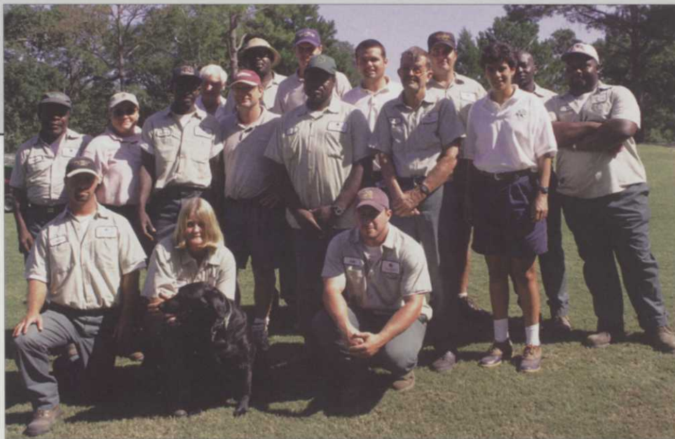
Killearn Country Club Maintenance Staff including Jake, the Labrador retriever, head of the Canadian Goose Patrol.