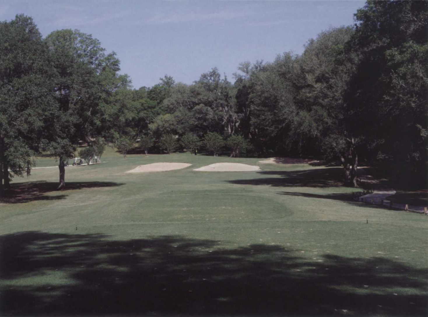
The rolling elevation changes of Killlearn are evident on #3 South, a downhill, 178 yard, par 3 hole.

pinetrees. The fairways of the 27-hole complex meander up and down the rolling hills bordered by brick homes reminiscent of Georgia and the Carolinas.