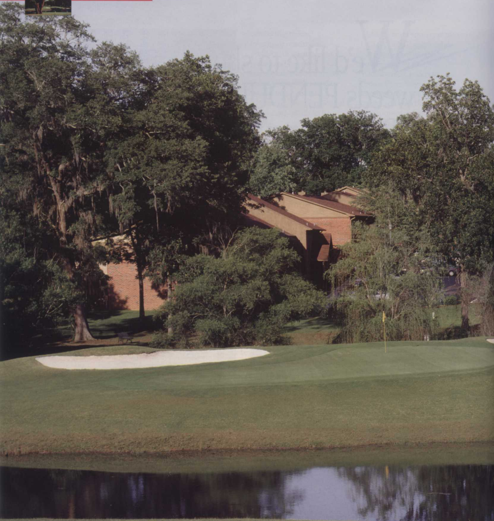
Number 2 North Par 3, 200 yards