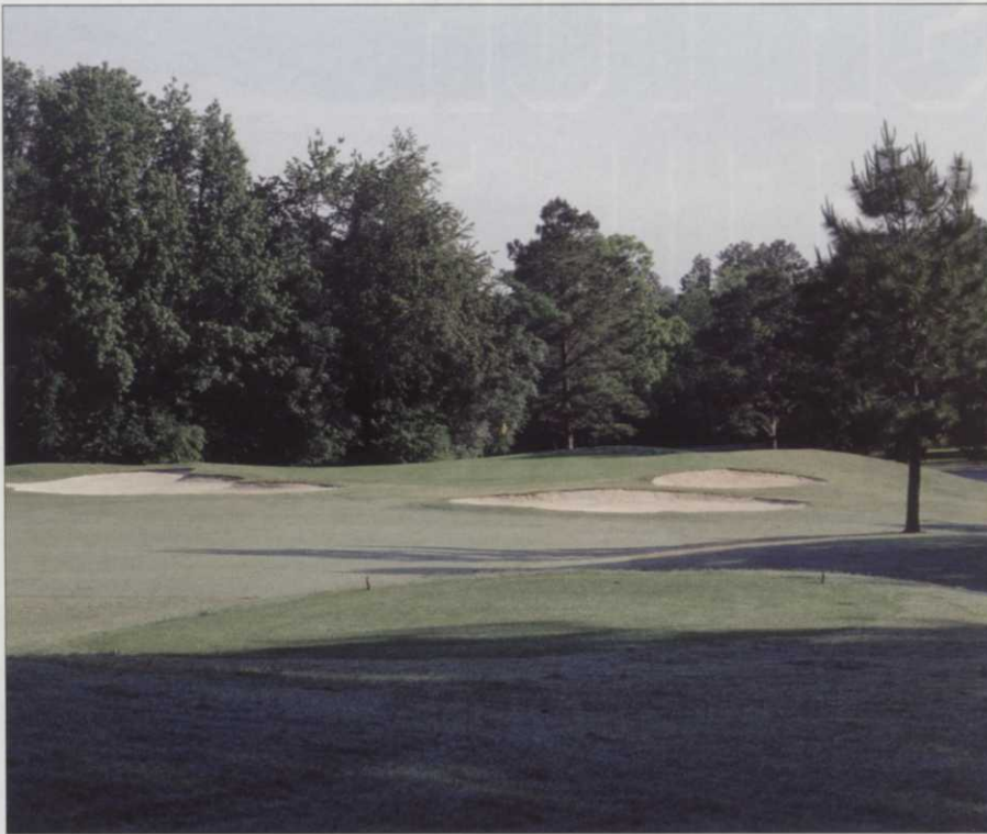
No. 7 North, a 170-yard par 3 seen from behind the forward tees.

Geri is one of only about 53 women superintendents who are members of the GCSAA.