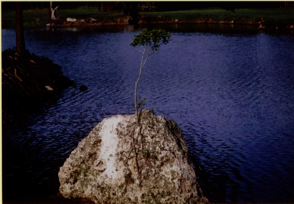
Second Place, above. Tough Tree by Gary Grigg, CGCS, MG, Royal Poinciana Golf Club.

Native plantings, including aquatic vegetation, grasses, shrubs, trees and wildflowers