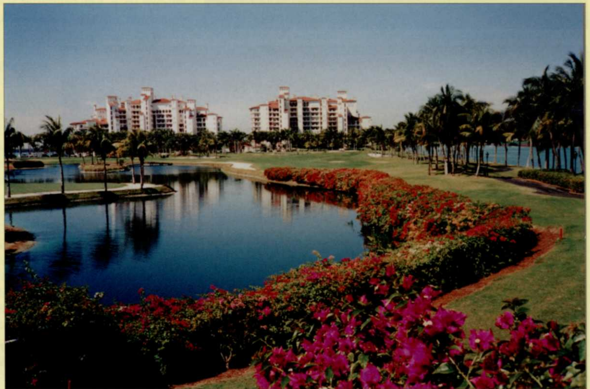
Second Place, above. Bougainvillea on No. 7 by Rick Cernesa, Links at Fisher Island.

Formal planting including annuals, shrubs, trees, entrance and tee signs