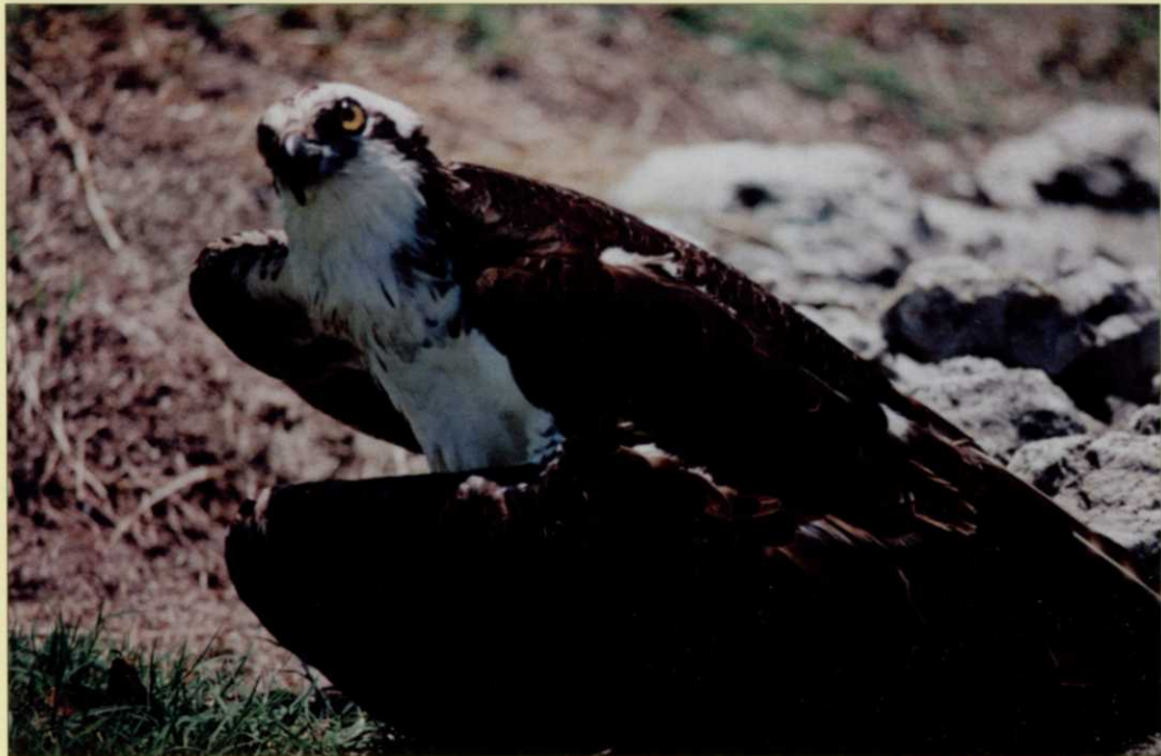
Second Place , above. Osprey by Tina Presenti, Imperial Golf Club