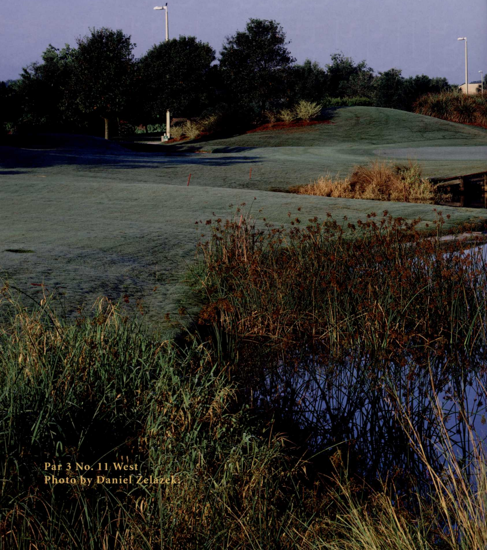
Par 3 No. 11 West