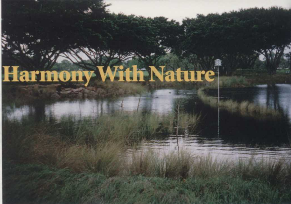
The same wetland area after construction. The improved wetland is now home to 5,000 cordgrass plants, purple martins, mallard ducks, coots, gallinules and American widgeons.

The Country Club of Florida first joined the Audubon Cooperative Sanctuary Program for Golf Courses in 1991. Its Audubon Committee was formed in 1996. It became certified in Environmental Planning in April 1997, and in December 1997 became certified in Out-