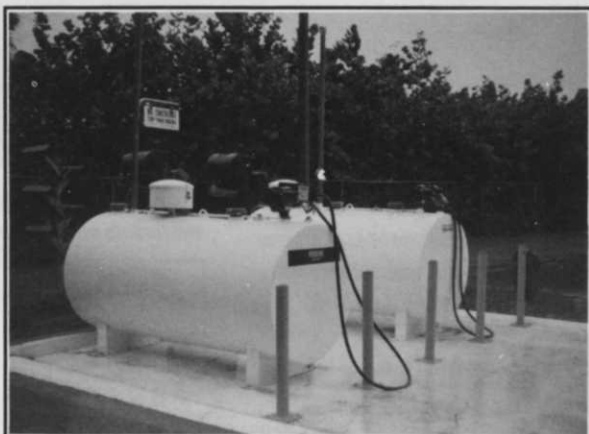
Orchid Island G.C

* "Get a good, reputable tank company . . ."