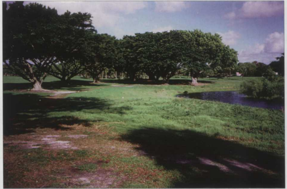
Country Club of Florida wetland area before renovation in 1997.

This plan was shared with the Country Club of Florida membership. The