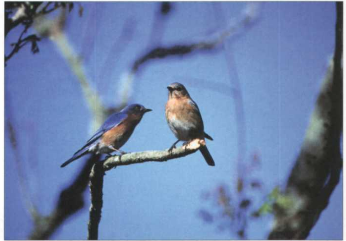
First Place, Wildlife: Male and female eastern bluebirds. March 1998. Royal Poinciana Golf Club.