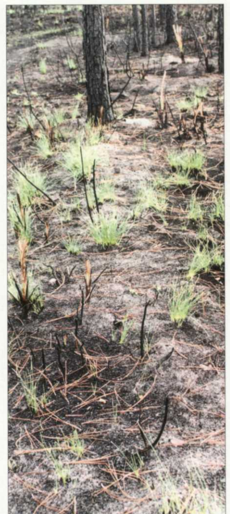
One week after the woods along the LPGA fairways were totally devastated, six to eight inch tall wiregrass clumps can be seen rising from the ashes as Mother Nature atones for her fury.