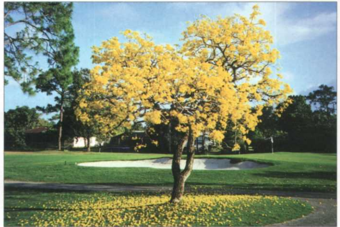
First Place, Course Landscape: Green and Gold. Palm Beach National Golf Club.