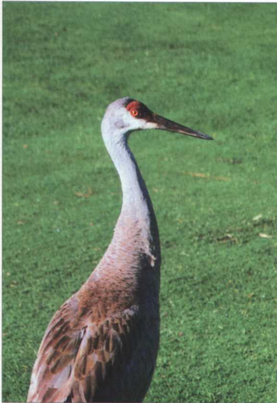
Second Place, Wildlife: Sandhill Crane. Palm Beach National Golf Club.