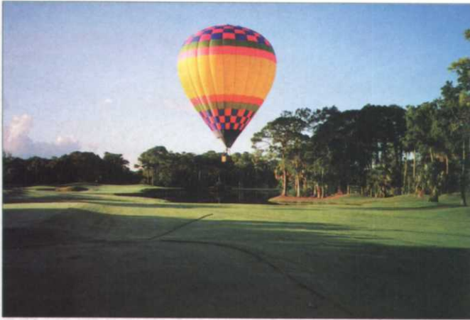
First Place, Scenic hole: Balloon over Boca Rio Golf Club.