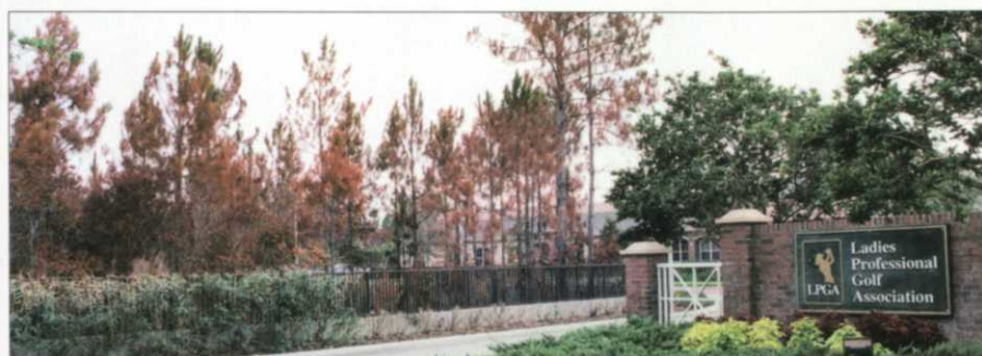
Blowing in from the northwest, wildfires came within 20 yards of the LPGA headquarters building with lots of LPGA historical memorabilia.