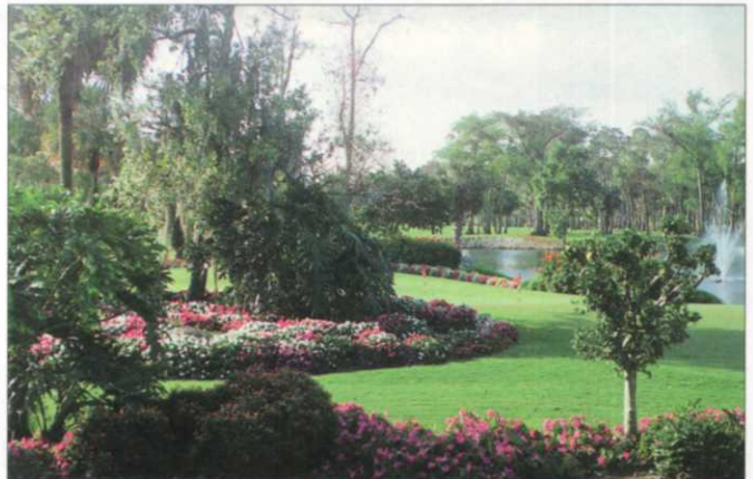
Second Place, Course Landscape: Royal Poinciana Golf Club Putting Green. Winter 1997-98.