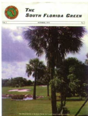
The first issue of the South Florida Green, published in October, 1973, had eight pages.

This newsletter will attempt to bring an exchange of ideas, of old and new methods of turf care. Members are encouraged to submit suggestions and