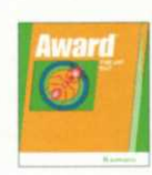
Fire Ant Control