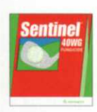
Fairway Brown Patch Dollar Spot