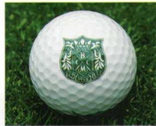
Bryn Mawr Country Club Lincolnwood, IL