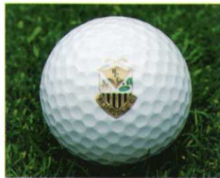
Bethesda Country Club Bethesda, MD