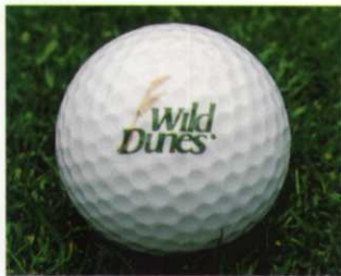
Wild Dunes Golf Links Isle of Palms, SC