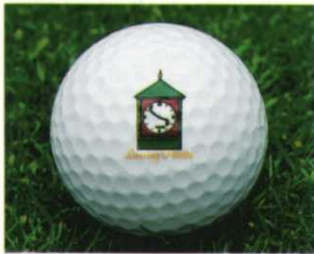
Lassing Pointe Golf Course Union, KY