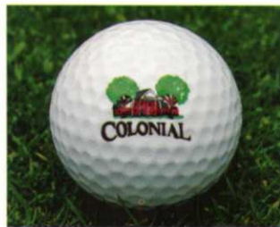
Colonial Country Club Fort Worth, TX