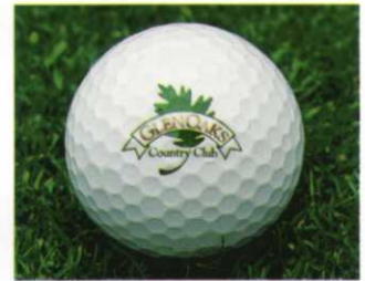
Glen Oaks Country Club West Des Moines, IA