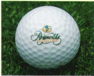
Reynolds Plantation Greensboro, GA