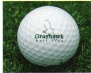
Grayhawk Golf Club Scottsdale, AZ