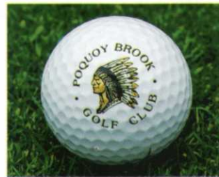
Poquoy Brook Golf Club Lakeville, MA