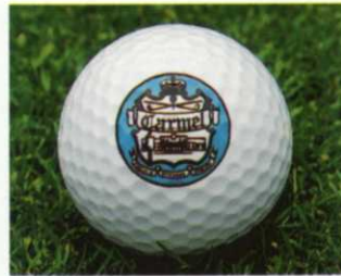
Carmel Country Club Charlotte, NC