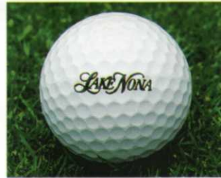
Lake Nona Club Orlando, FL