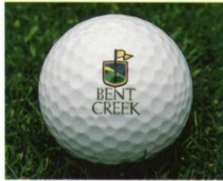
Bent Creek Country Club Lancaster, PA