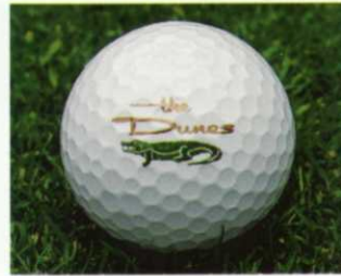
The Dunes Golf & Beach Club Myrtle Beach, SC