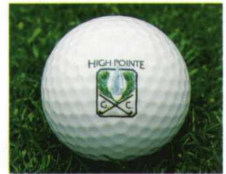
High Pointe Golf Club Williamsburg, MI

A golf course's biggest asset is its grass. Fast greens, luxurious fairways, and thick roughs leave lasting impressions with every golfer.