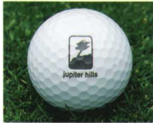
Jupiter Hills Club Jupiter, FL