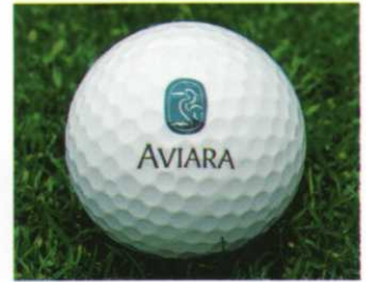
Four Seasons Resort Aviara Carlsbad, CA