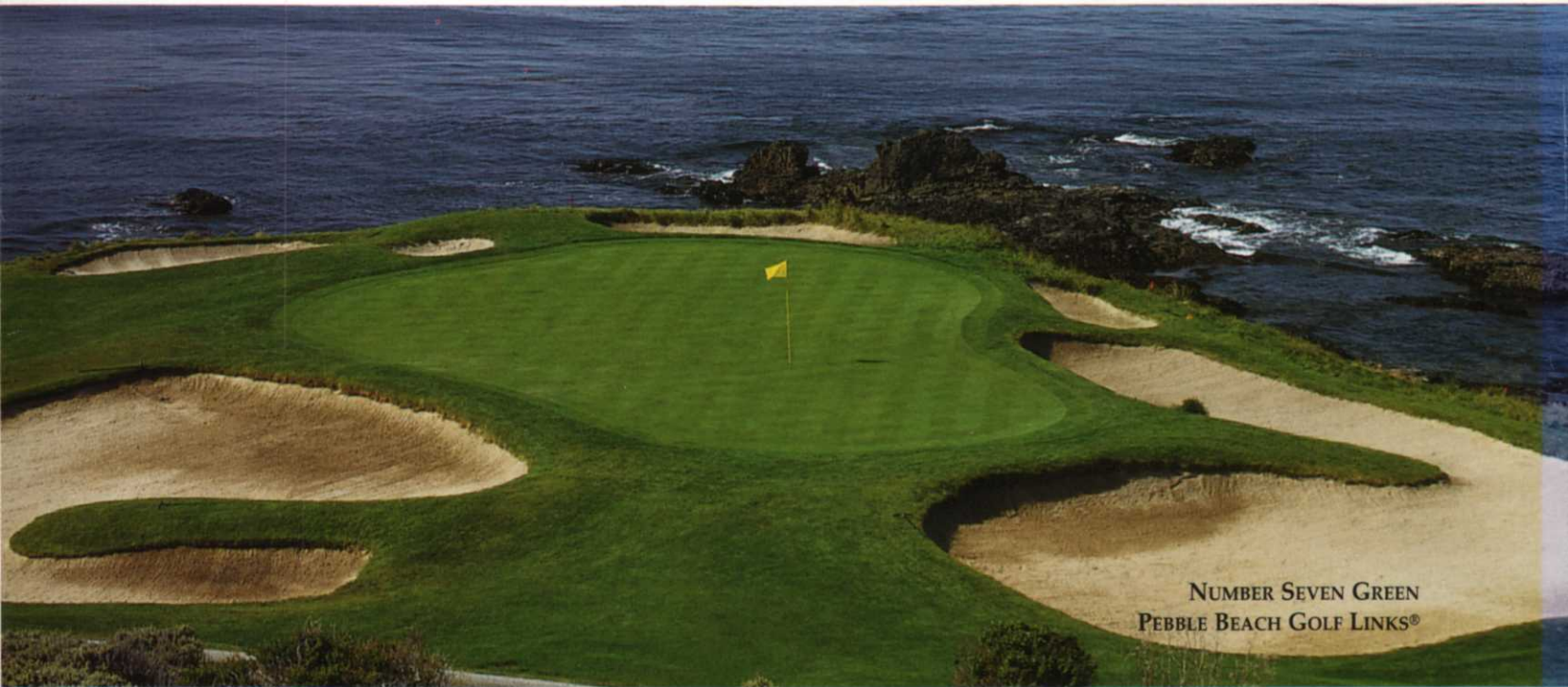
NUMBER SEVEN GREEN PEBBLE BEACH GOLF LINKS®