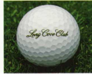
Long Cove Club Hilton Head Island, SC