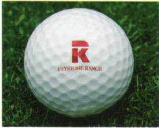
Keystone Ranch Golf Course Keystone Resort, CO