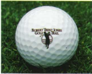
Grand National Auburn/Opelika, AL