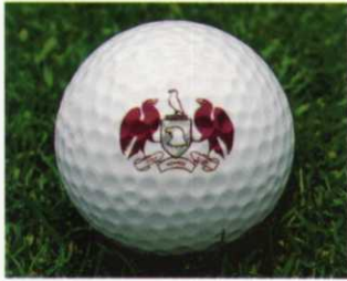
Monroe Golf Club Pittsford, NY