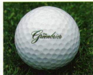
The Greenbrier White Sulphur Springs, WV