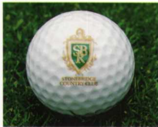
Stonebridge Country Club McKinney, TX