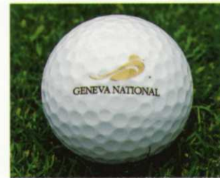
Geneva National Golf Club Lake Geneva, WI

Which gives crews more opportunity to rebuild sand traps, tend to flower beds, and do all the other things that make good courses great. And great courses even greater.