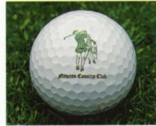
Newton Country Club Newton, NJ