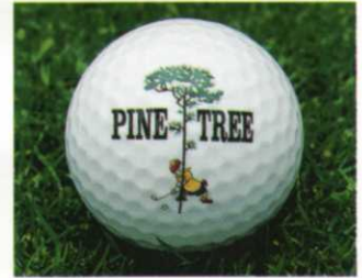
Pine Tree Golf Club Boynton Beach, FL