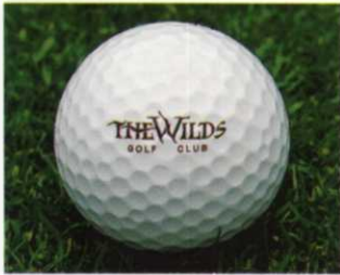
The Wilds Golf Club Prior Lake, MN