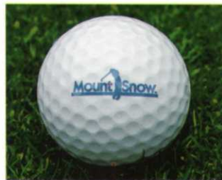
Mount Snow Golf Course West Dover, VT