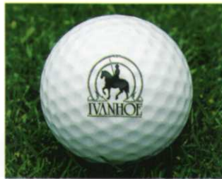
Ivanhoe Club Ivanhoe, IL