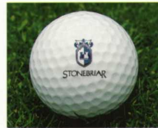
Stonebriar Country Club Frisco, TX