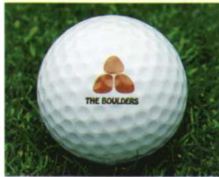
The Boulders Resort Carefree, AZ