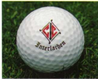
Interlachen Country Club Edina, MN