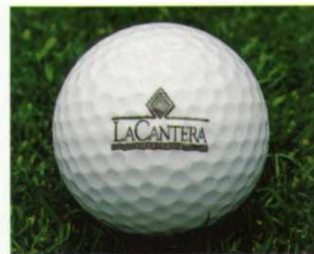
La Cantera Golf Club San Antonio, TX