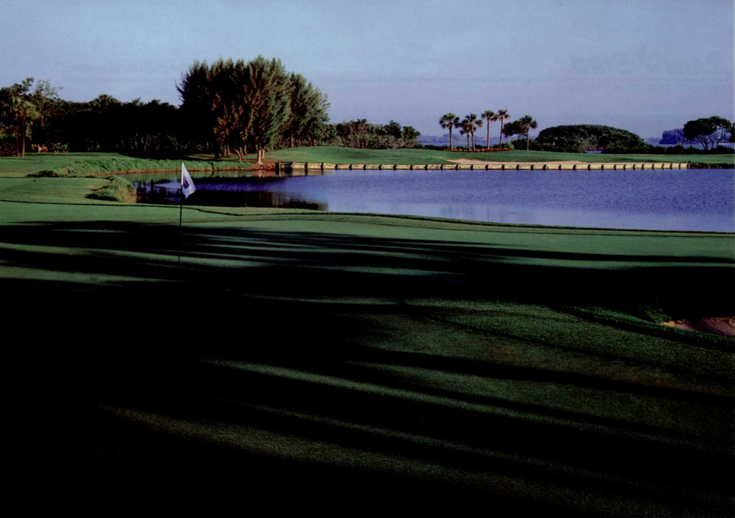
Early morning view from behind #4 green. The #3 green and the Indian River are in the background.

has been there from the rebuilding of the greens in 1988 to the ongoing drainage work in some of the fairways and bunkers.