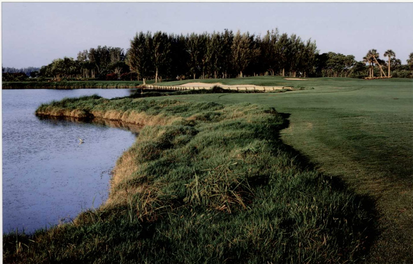
"No mow" zones like this one on hole #3 help stabilize the banks and provide habitat for birds and fish.

daydreaming of wetting a line or getting distracted by striking fish and the constant stream of fishing boats and yachts slipping past the course leaving trails of white foam in the blue waters. It is truly a paradise setting. But paradise comes with a price, and I don't mean just land values.