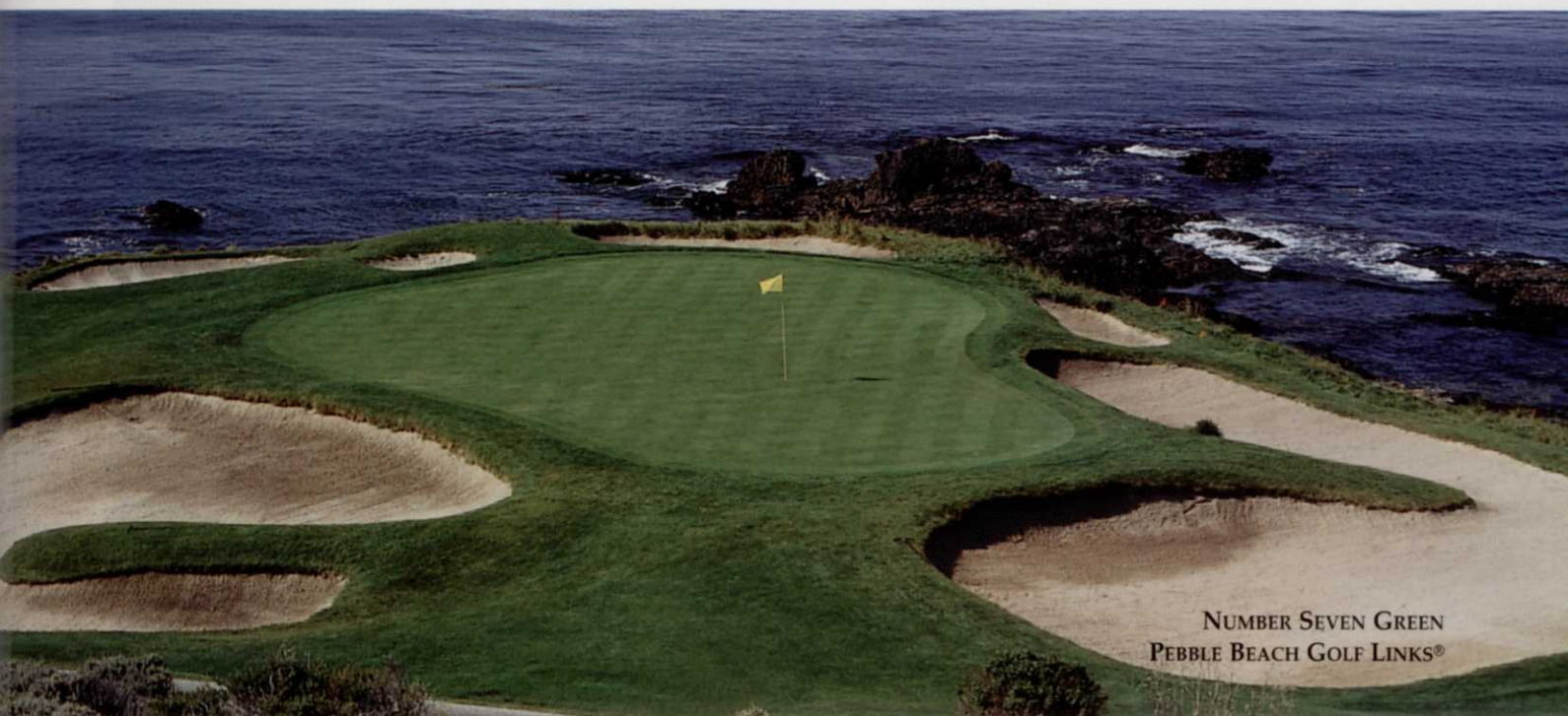
NUMBER SEVEN GREEN PEBBLE BEACH GOLF LINKS®