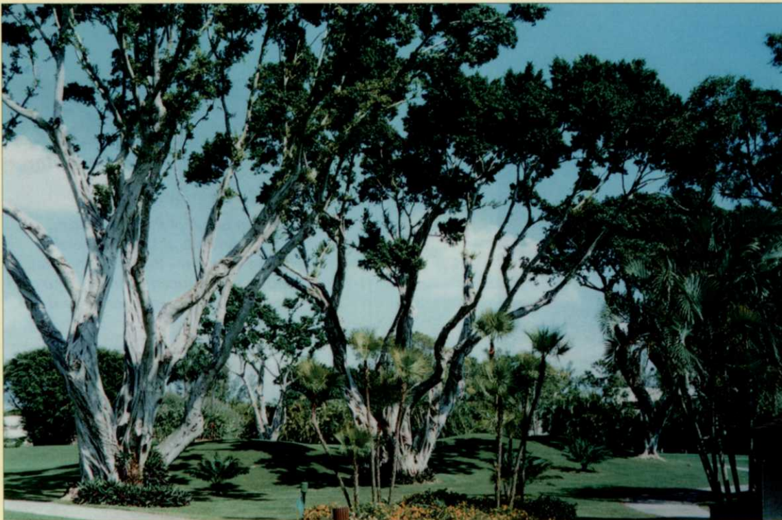
First Place Native Plantings Bryan Singleton, GCS Riviera CC