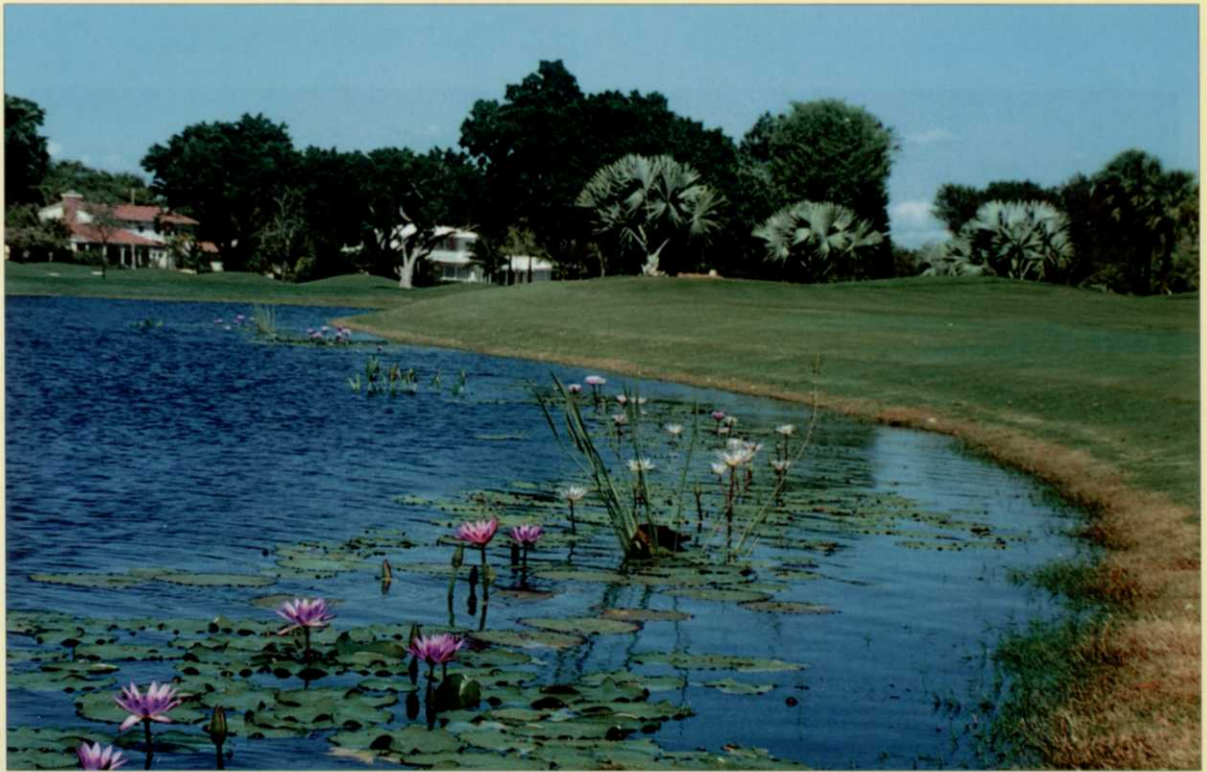
Second Place, Native Plantings Debra DeMarco Riviera CC