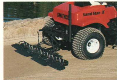
TWIN - PHASE RAKING SYSTEM