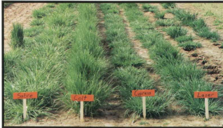
Cypress' prostrate growth habit is apparent in these P.V.P. trials. One picture is worth 1000 words.