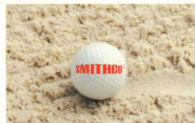
SUPERIOR SURFACE FINISH