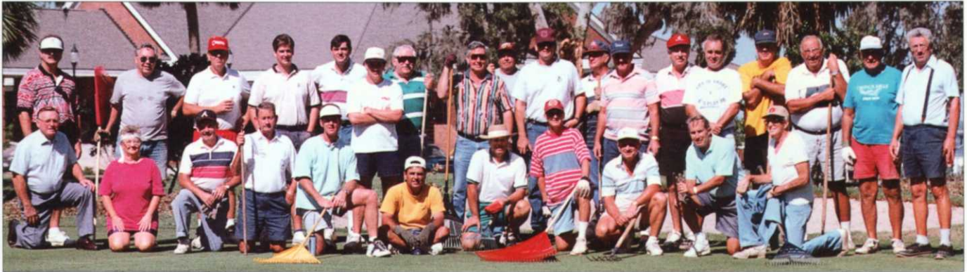
Member Work Day. Some of the 75 members who helped the maintenance crew remove 200 tons of debris in a day and a half. Two days after Hurricane Opal the Panama City CC was open for play.

The story does not end at the tournament. We had a huge oak tree on the #8 tee that fell and drove the cart path 6 feet in the ground. The tree was so large that we could not even move the logs. I cut off all but 10 feet of the stump and then set the old stump back erect so we could repair the path and tee. I said in passing to