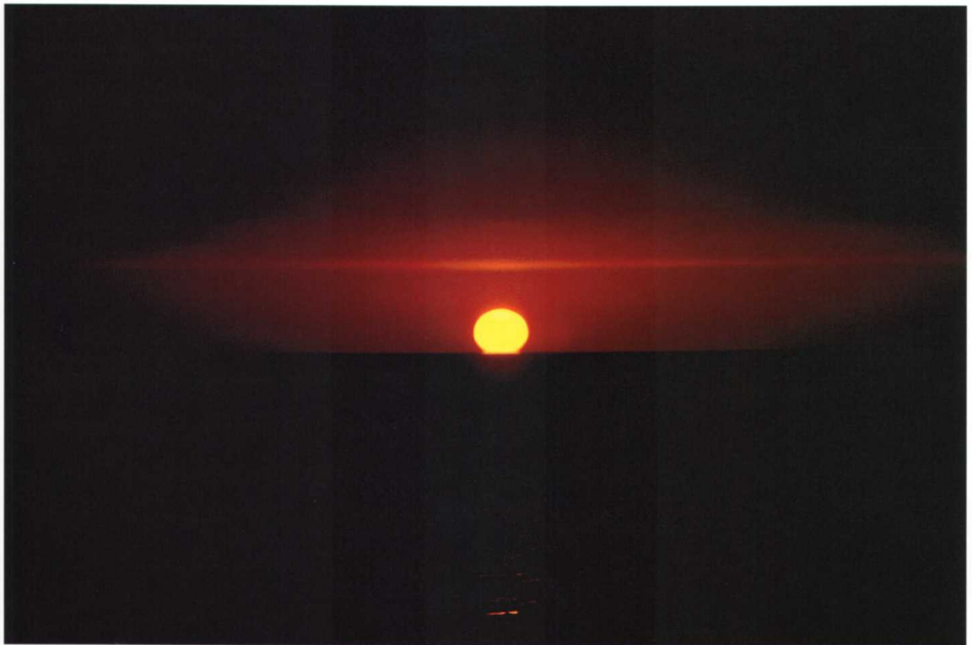
Out-of-towners soon became “sundowners” at the Naples Beach Club.