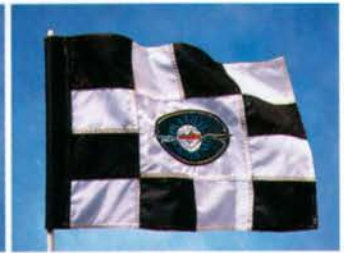
Prairie Landing West Chicago, IL