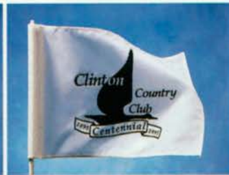
Clinton Country Club Clinton, CT