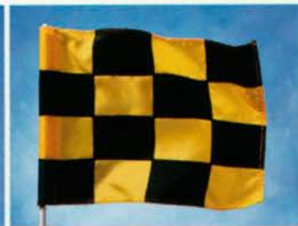
Troon Golf & Country Club Scottsdale, AZ

growth periods, Primo gives you more mowing flexibility, so your crew has more time for jobs like rebuilding sand traps and reworking flower beds. And when you do mow, there are fewer clippings you'll have to worry about.