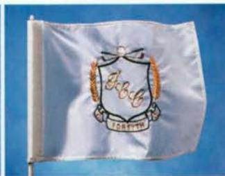
Forsythe Country Club Winston-Salem, NC