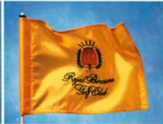
Royal Poinciana Golf Club Naples, FL