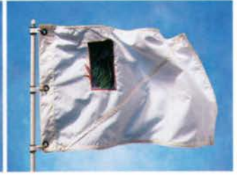
Granite Bay Golf Club Granite Bay, CA