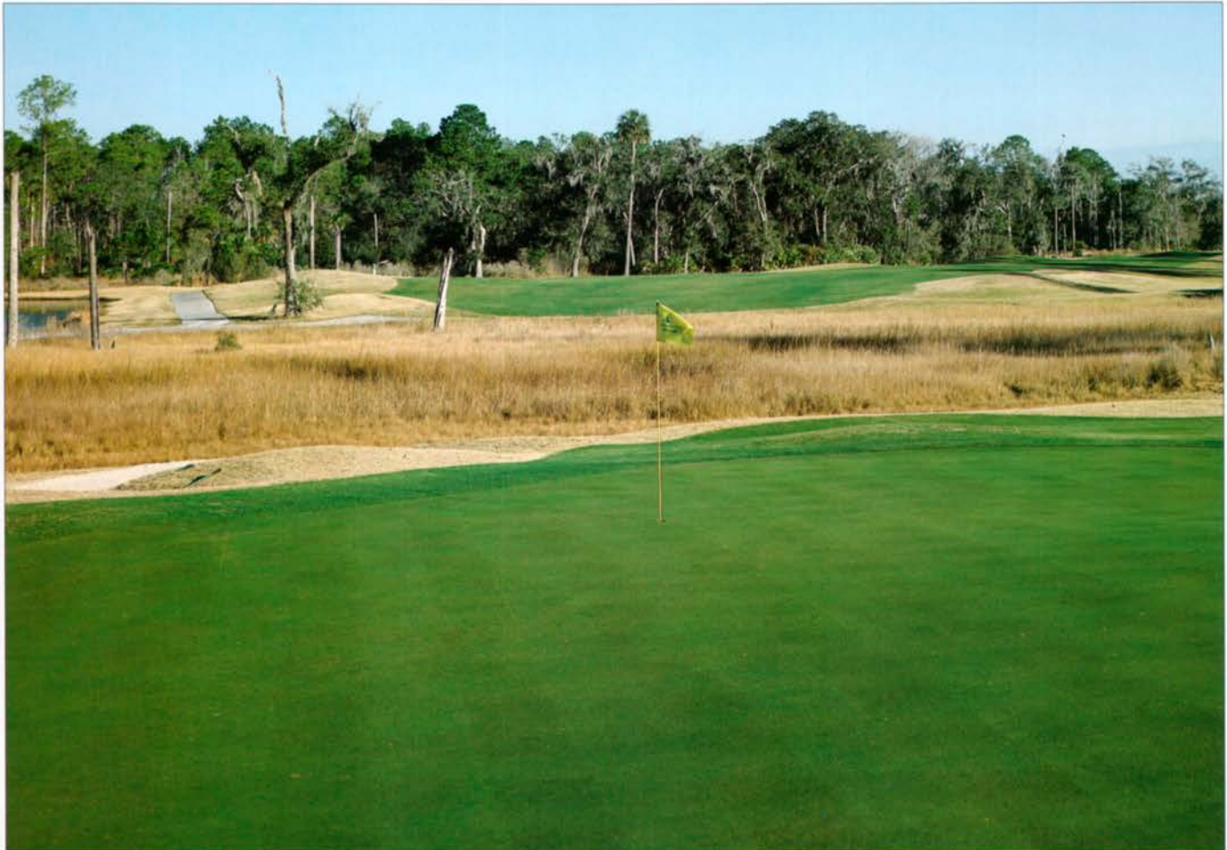
The approach shot on the 8th hole must carry the marsh fronting the green.