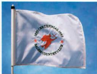
Salem Country Club Peabody, MA