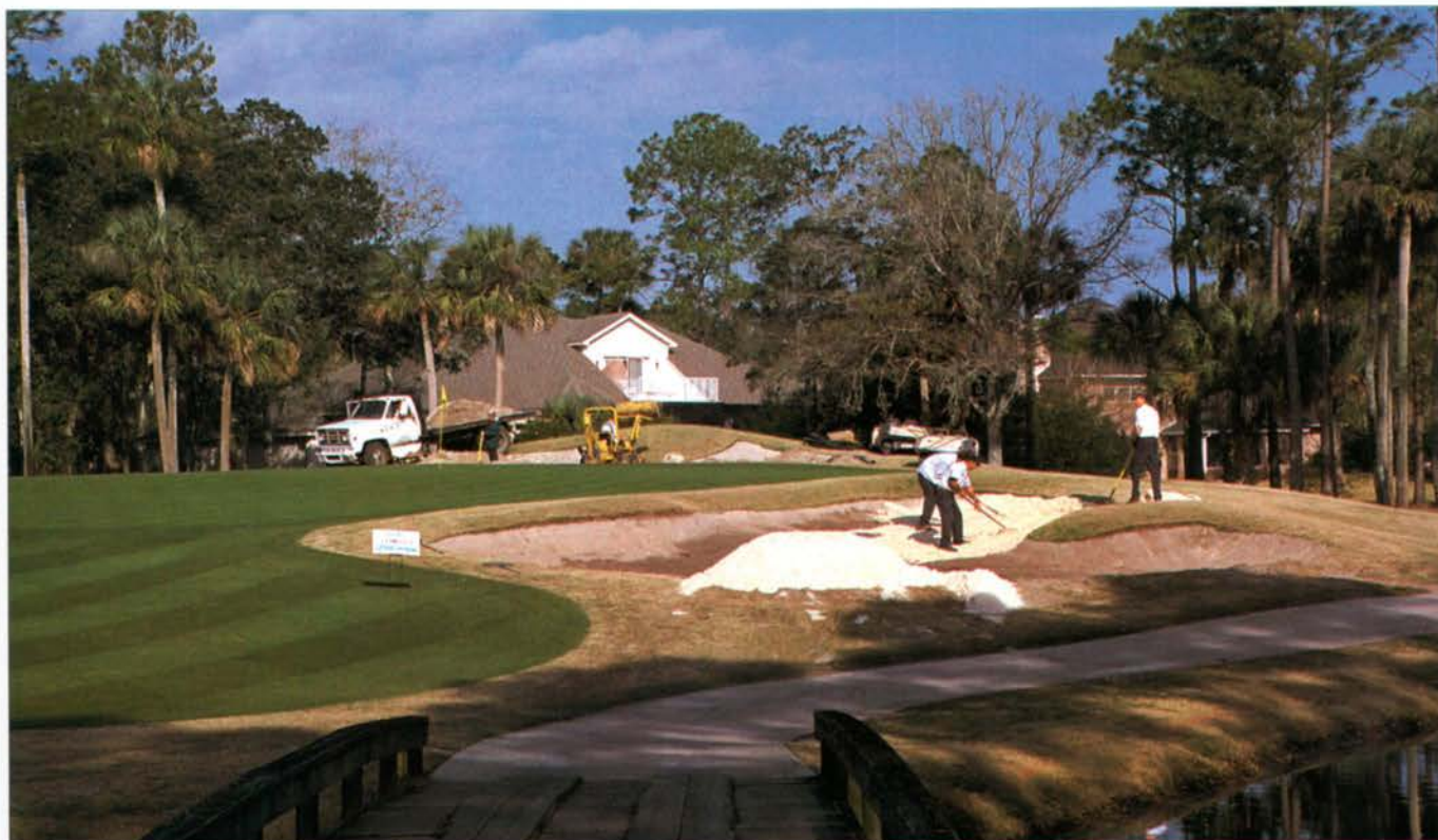
Marsh Landing's 1996 bunker project is under way on #17 green.