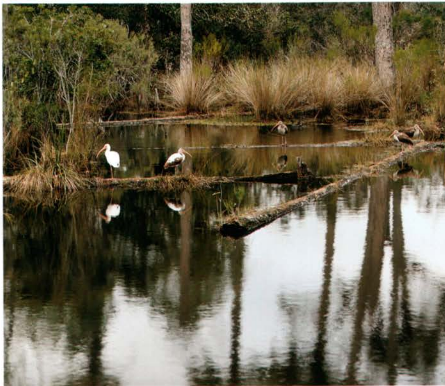
Ibis, egrets, mallards and a wood stork share the marsh pond behind #3 tee.