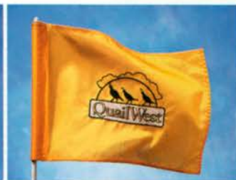
Quail West Golf & Country Club Naples, FL