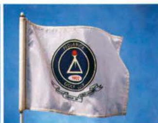
Pequabuck Golf Club Pequabuck, CT