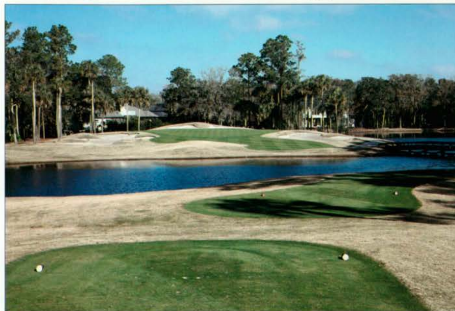
One of several freshwater lakes on the back nine highlights the 17th hole.

3 pounds of Penneagle bentgrass and 9 pounds of Laser Poa trivialis. With 30,000 to 36,000 rounds of golf a year, the owners and members want the greens on the fast side. We have only made one granular application of fertilizer to the greens since seeding. Instead we apply 1/10 of a pound of nitrogen weekly using Nutriculture’s 28-8-18 Bentgrass Special soluble fertilizer. Right now we’re mowing the greens at .130 inches. In the warm season, we apply 1/2 pound of nitrogen