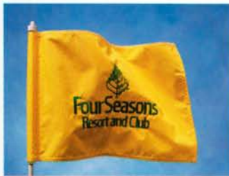
Four Seasons Resort & Club Irving, TX