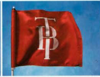
Tumble Brook Country Club Bloomfield, CT