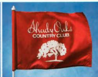
Shady Oaks Country Club Fort Worth, TX