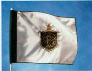
Governors Club Chapel Hill, NC