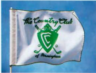
The Country Club of Birmingham Birmingham, AL