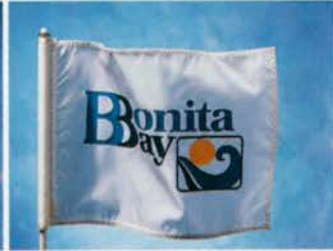
Bonita Bay Club Bonita Springs, FL