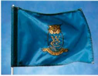
Wildcat Cliffs Country Club Highlands, NC