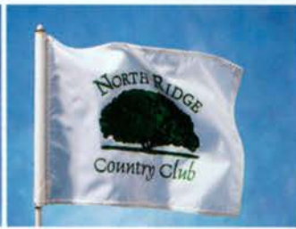
North Ridge Country Club Fair Oaks, CA