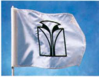
Blackwolf Run Kohler, WI