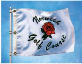
Norwich Golf Course Norwich, CT