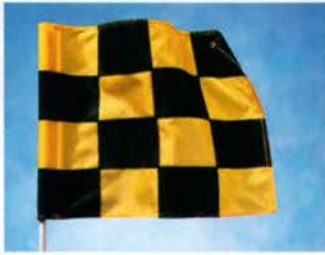
Forest Ridge Golf Club Broken Arrow, OK