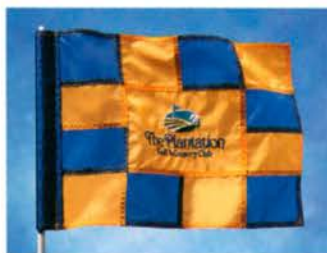
The Plantation Golf & Country Club Venice, FL