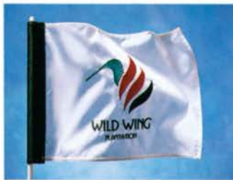
Wild Wing Plantation Conway, SC