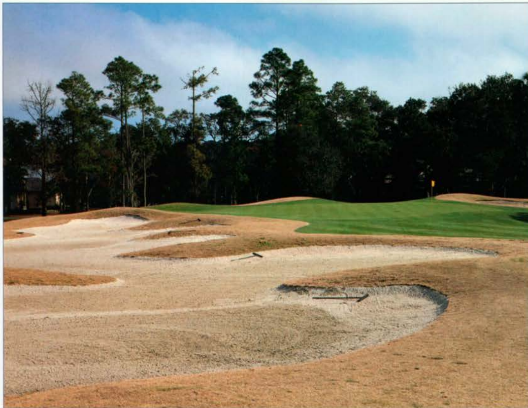
The 11th hole shows its mettle with a formidable bunker on the left side.

the look. I call it the “Arizona Look” from the way the courses look on TV at the Phoenix and Tucson Opens.