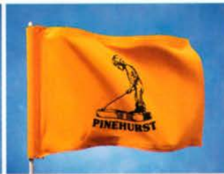
Pinehurst Resort & Country Club Pinehurst, NC