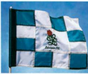
Lancaster Country Club Lancaster, PA